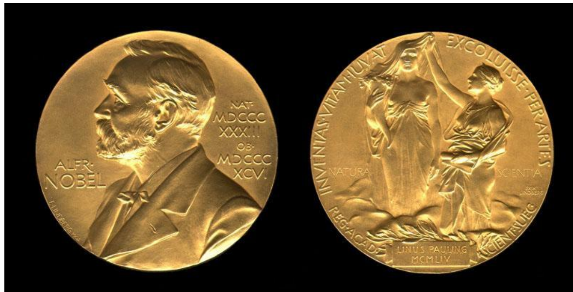
The medal is awarded to the winner of the Nobel Prize.

The Nobel Prize - one of the most prestigious international prizes, awarded for outstanding scientific research, the revolutionary invention or a major contribution to the culture or society.