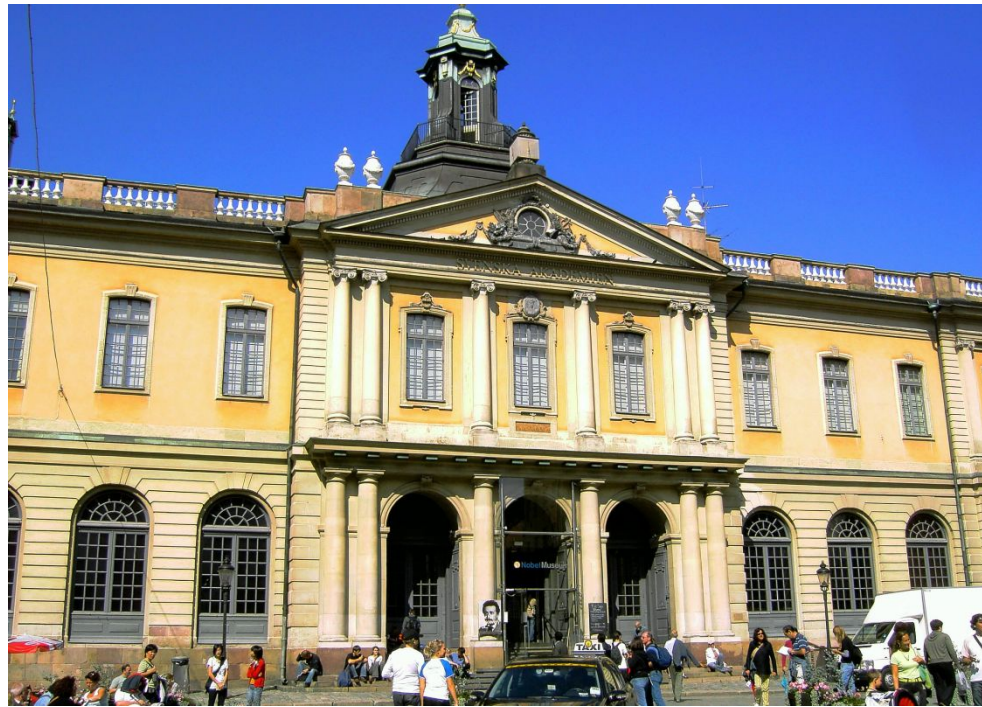
The Swedish Academy

Selecting the winners perform The Royal Swedish Academy of Sciences, the Swedish Academy, the Nobel Assembly at the Karolinska Institute and the Norwegian Nobel Committee.