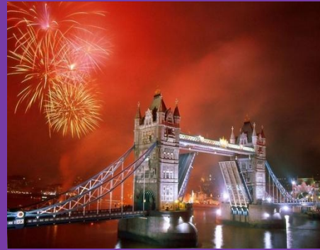
The Tower of London