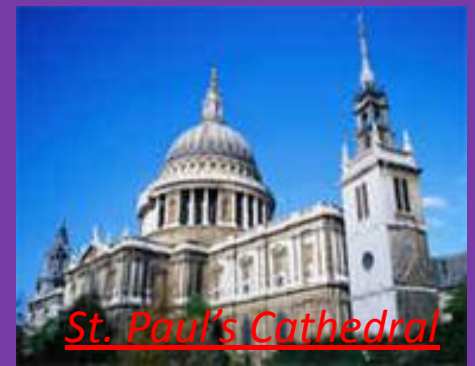
St. Paul's Cathedral