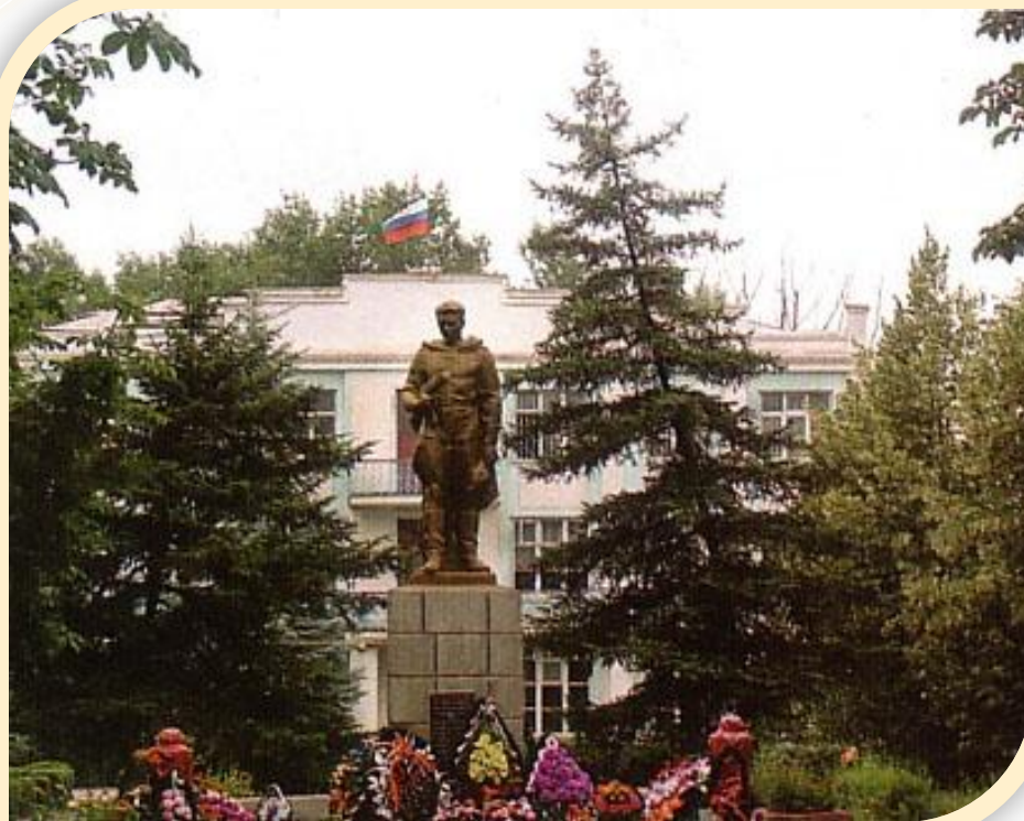
The Monument to the Unknown Soldier.

A lot of people come here to honour and remember in the peaceful times the fallen heroes, to know and understand the past and the future