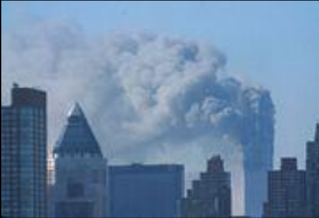
The WORLD TRADE CENTER on the morning of September 11, 2001.