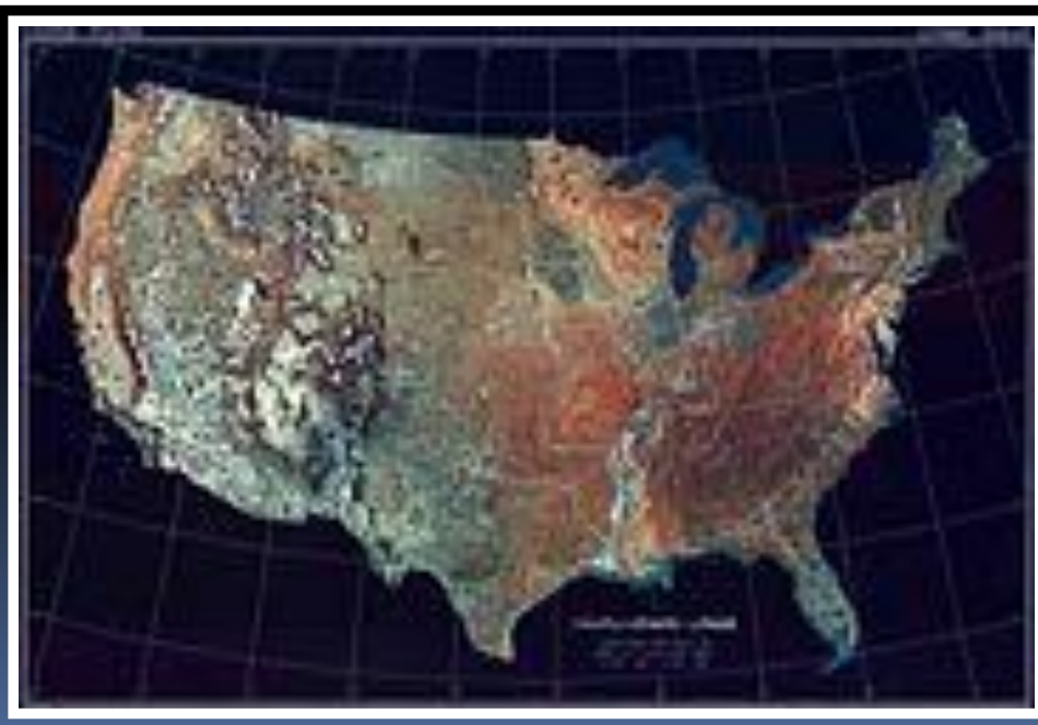
TOPOGRAPHIC MAP OF THE CONTIGUOUS US.