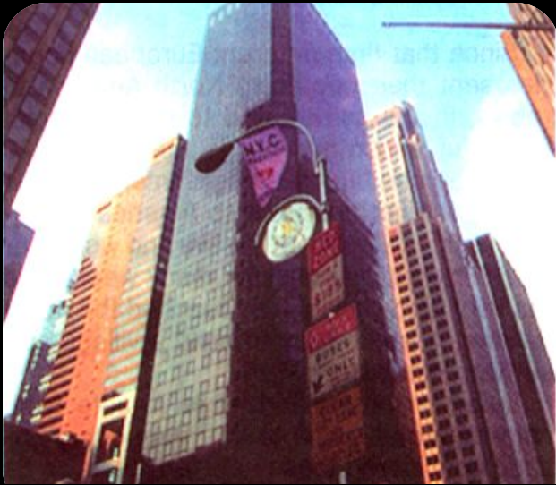
Skyscrapes in New York.