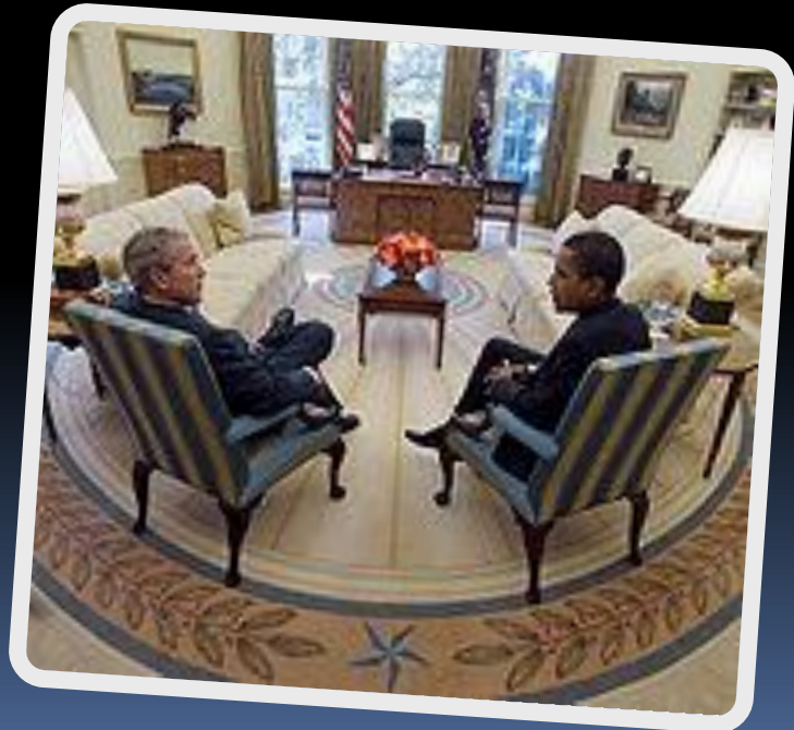
PRESIDENT-ELECT BARACK OBAMA (RIGHT) MEETS WITH CURRENT PRESIDENT GEORGE W. BUSH (LEFT) IN THE OVAL OFFICE, NOVEMBER 10, 2008.