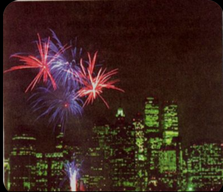
Firework on Independence Day.