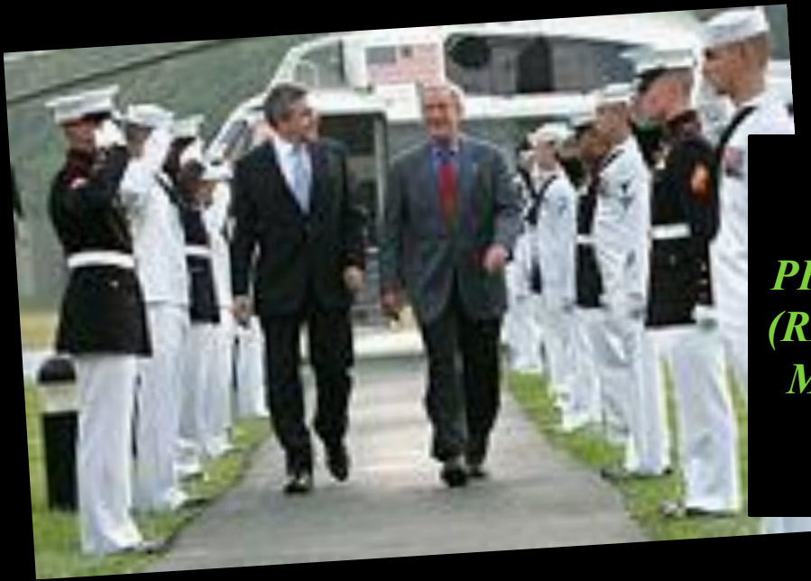
PRESIDENT GEORGE W. BUSH (RIGHT) WITH BRITISH PRIME MINISTER GORDON BROWN.