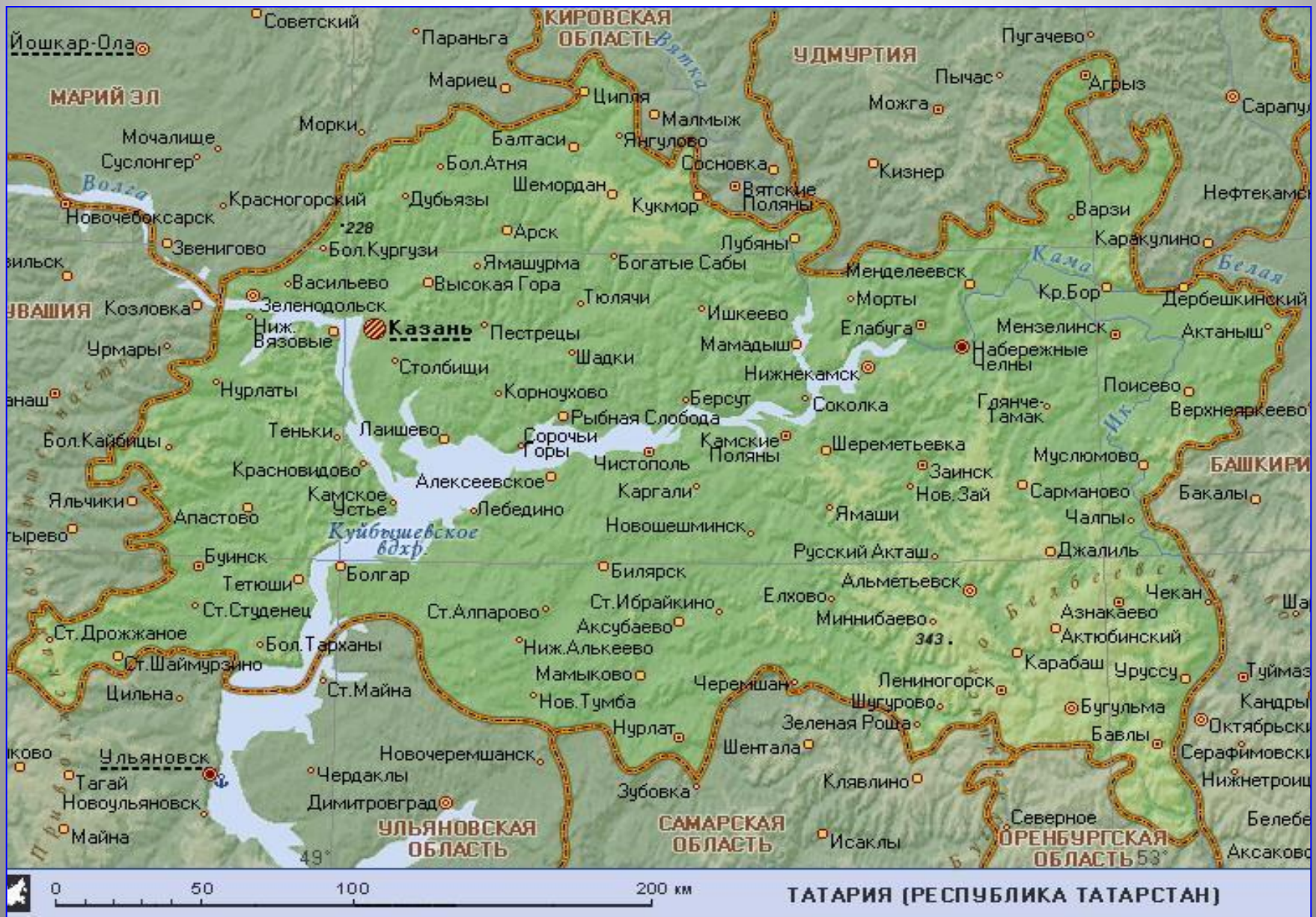
The map of Tatarstan