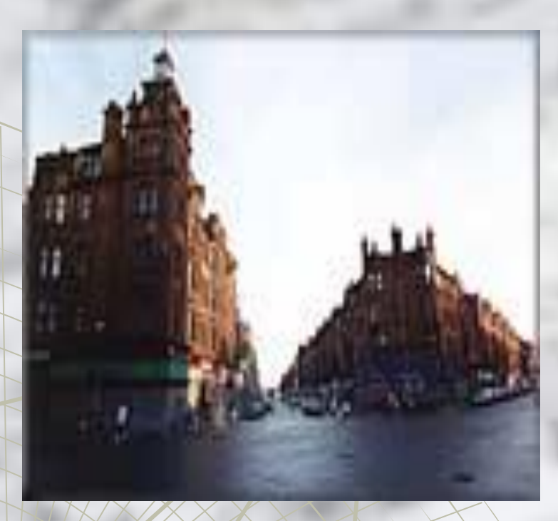
Glasgow's history stretches back almost two thousand years.

Originally it was small salmon-fishing village at a crossing point on the River Clyde.