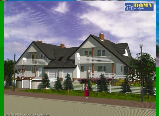
A detached house