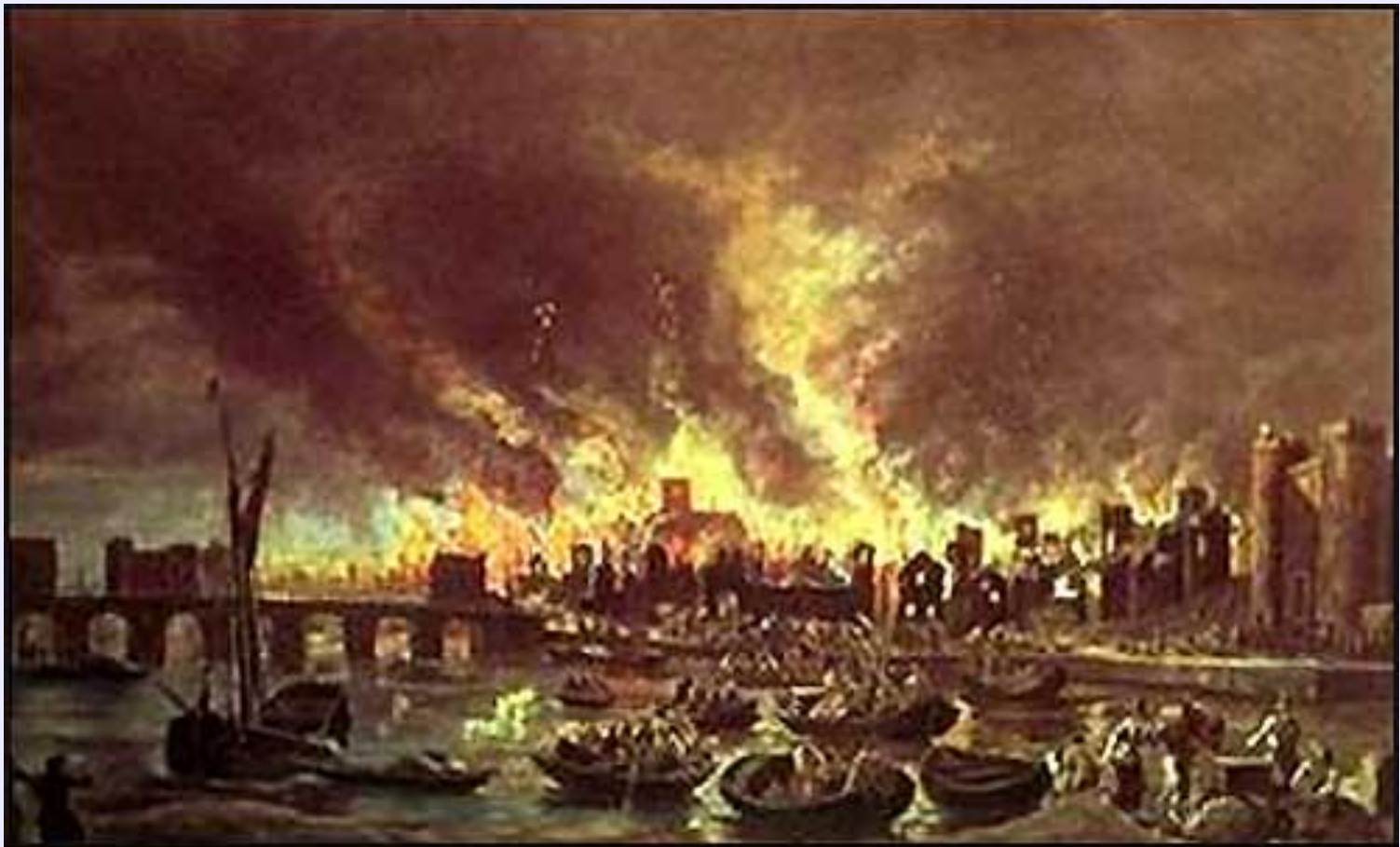
The Great Fire of London, 1666. Lieve Verschuer.

The buildings were also very close together, so the fire spread from one street to another quickly.