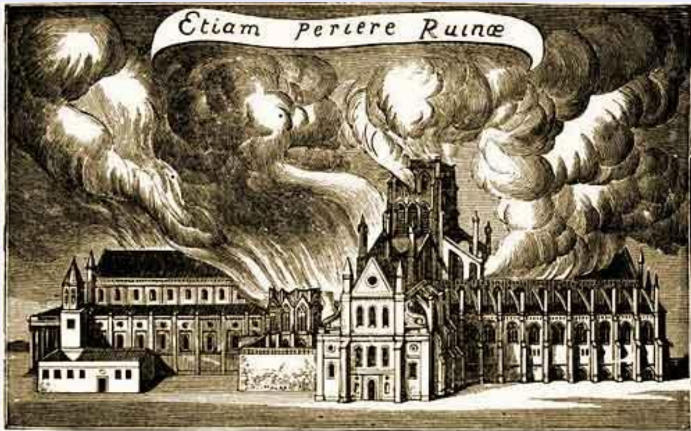
Old St. Paul's on Fire.

The fire destroyed many buildings in London. They were later rebuilt using bricks instead of wood.