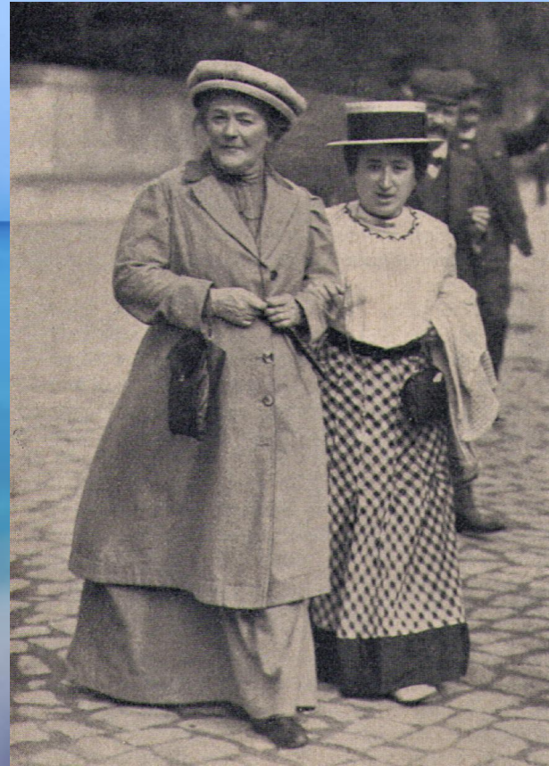
Clara Zetkin & Rose Luxemburg, 1910

In 1910 the first international women's conference was held in Copenhagen by the Second International and an 'International Women's Day' was established, which was submitted by the important German Socialist Clara Zetkin, although no date was specified.