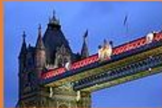
Close-up of walkways, illuminated at dusk