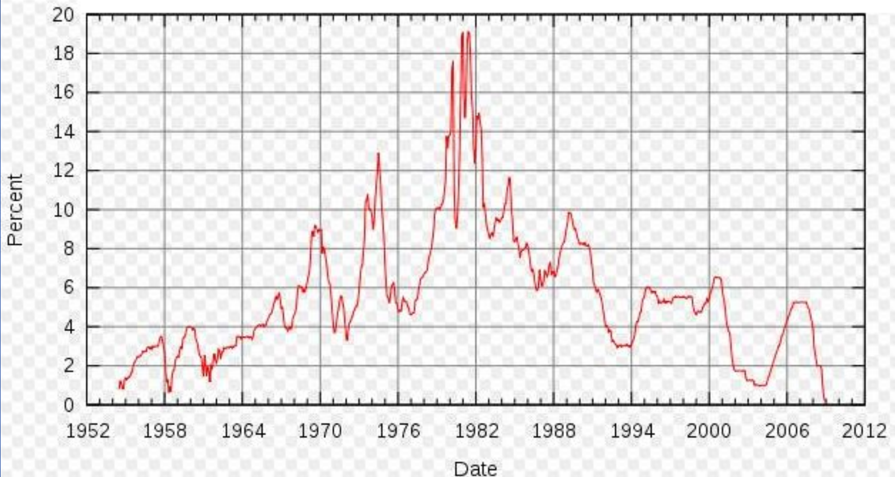
Federal funds rate in the U.S.