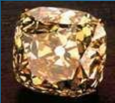
“Yellow diamond of Tiffany”