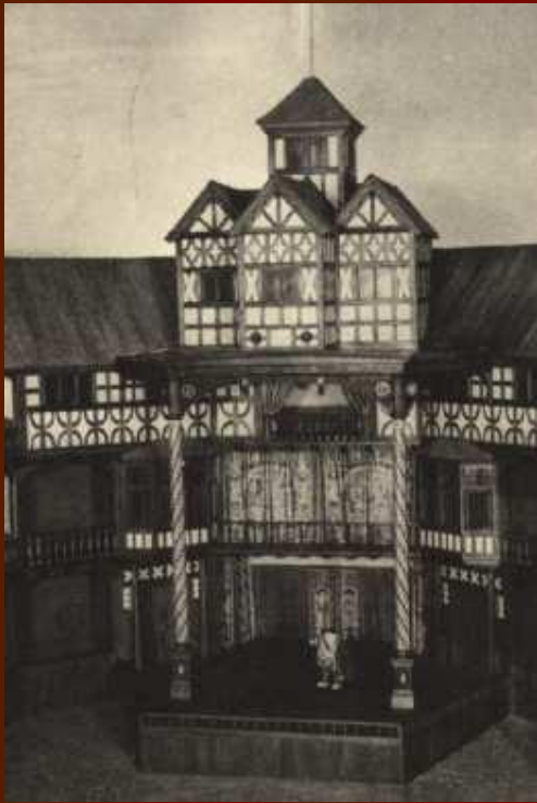
Entrance of The Globe Theater