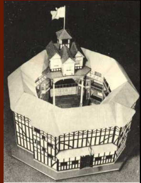
Top view of Shakespeare's Globe Theater