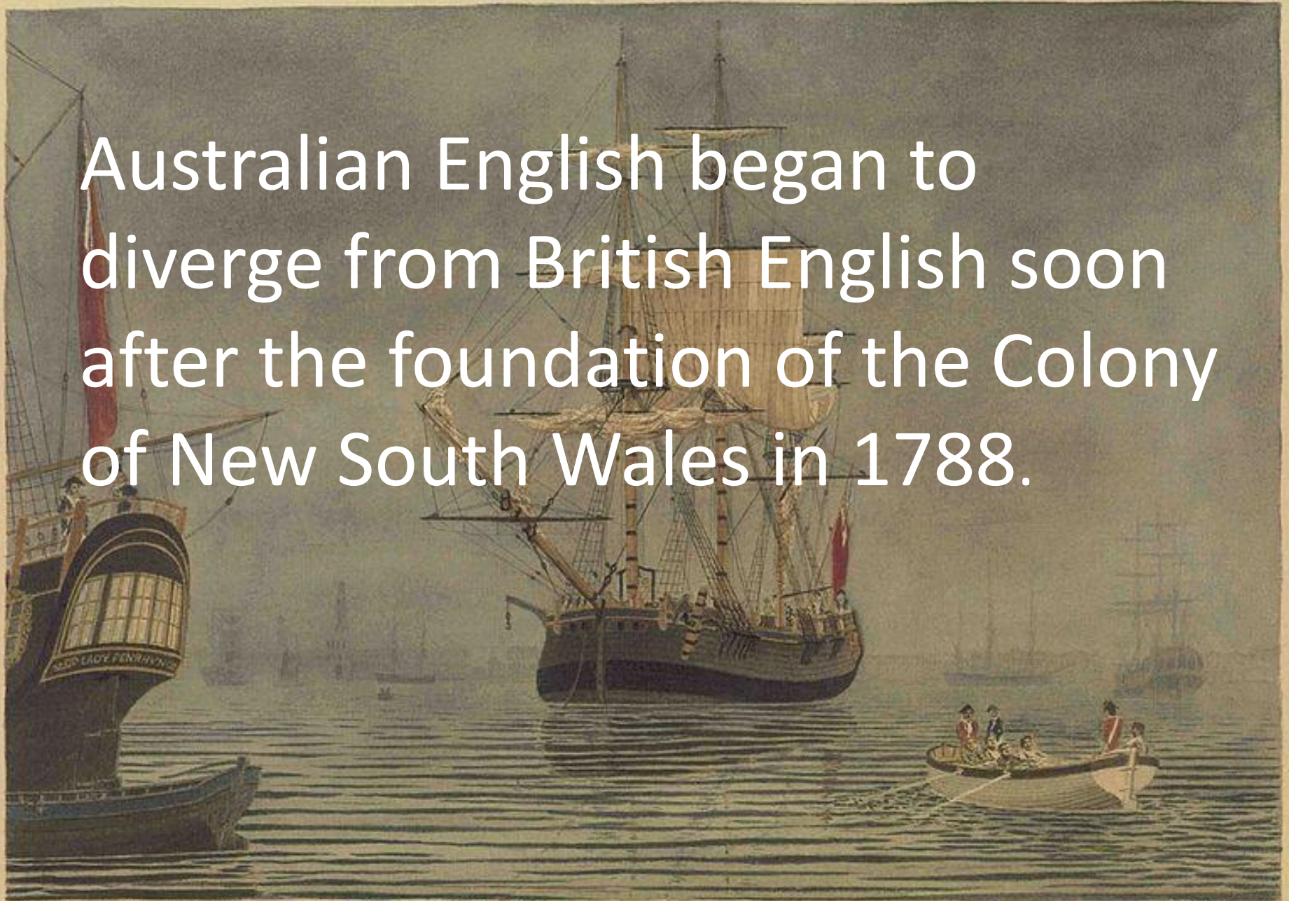
"CHARLOTTE" 335 TONS. At Portsmouth prior to departure, May 1787

Australian English began to diverge from British English soon after the foundation of the Colony of New South Wales in 1788.