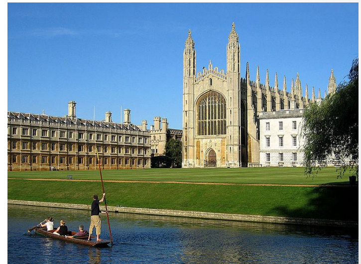
King's College Chapel, seen from The Backs