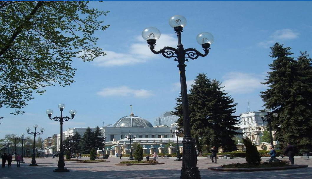
The Verchovna Rada

Maryinsky Park is one of the oldest parks in Kiev. It now hosts two important buildings