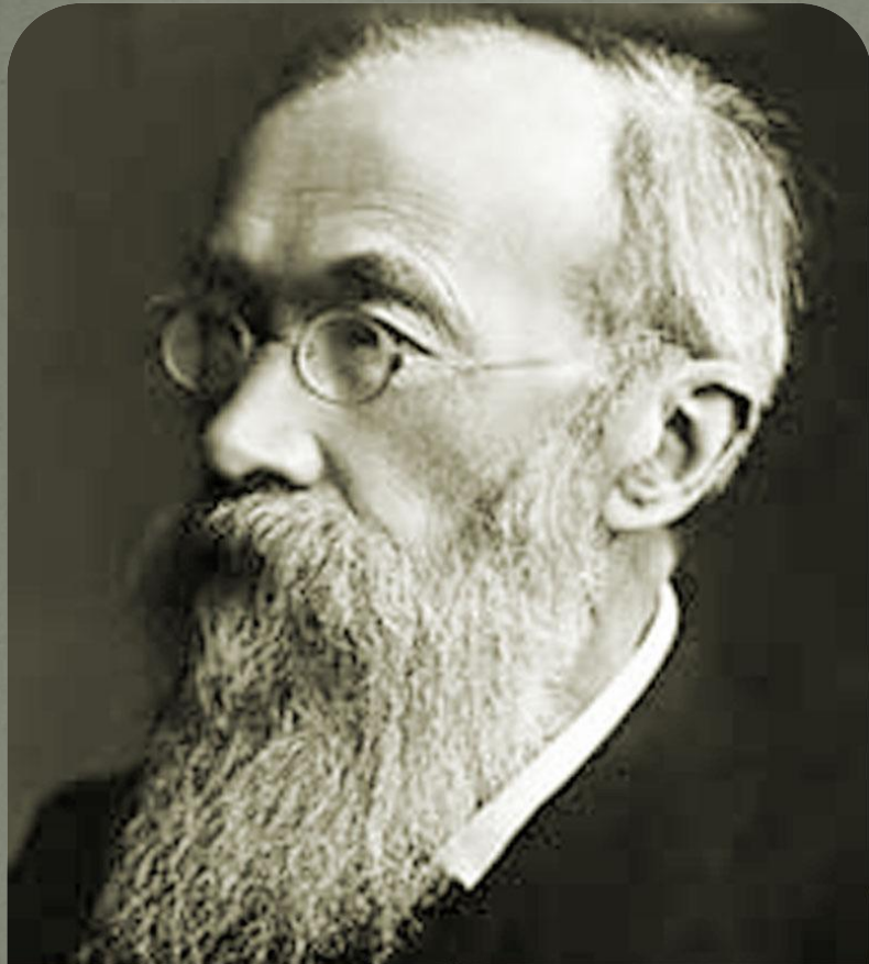
Вильгельм Вундт ВНЦРЛСРМ ВЛНЦЛ