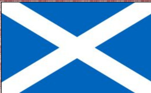
flag of Scotland