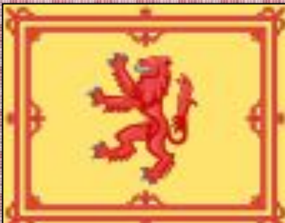
Royal Standard of Scotland