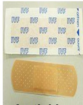
A sticking plaster