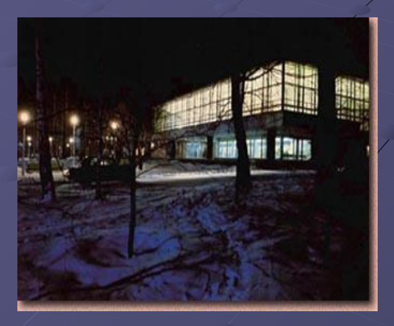
The house of the scientists in the night