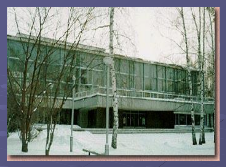
The house of the scientists

Science is one of the basic sources of the employment of the population in Novosibirsk Akademic centre.In Lavrentyev' avenue there are more than 40 research institutes.