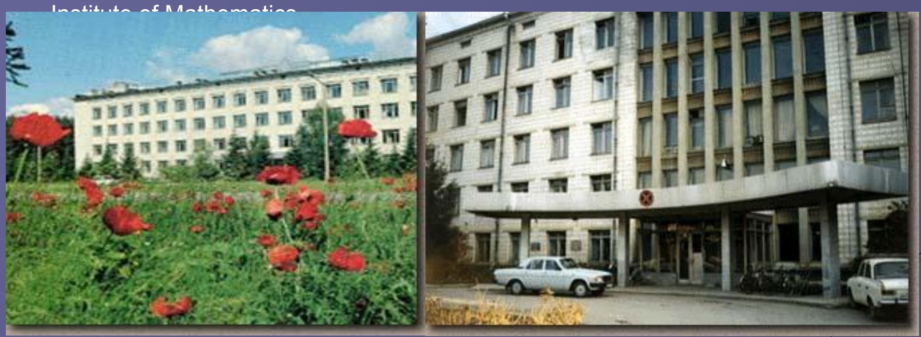
Institute of Mathematics