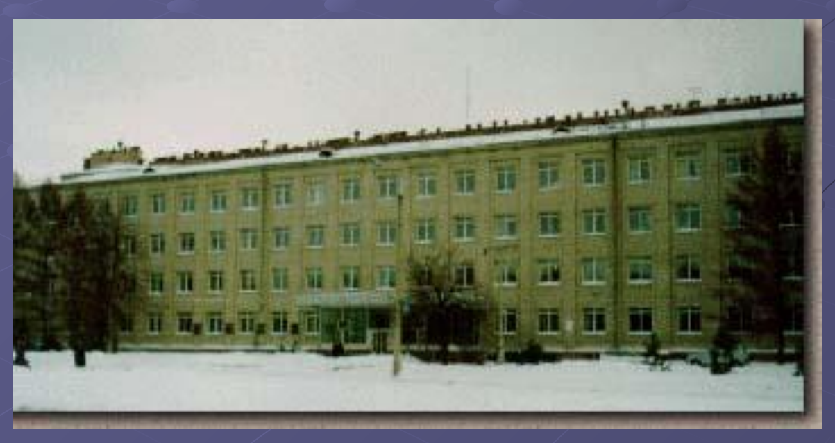
Institute of Geology

The Akademic centre is a prototype of a number of such centres of science in other countries. The Novosibirsk centre of science is the largest in the Siberian branch of SO RAN, there is about a half of its scientific potential there. The centre was built in 1957.