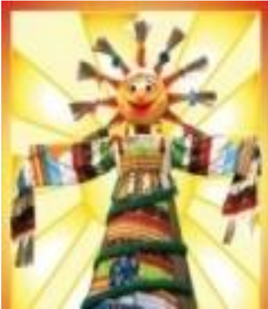
A Maslenitsa doll.