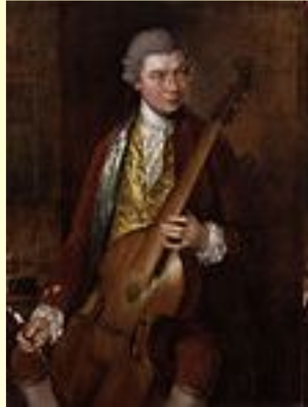
Portrait of the Composer Carl Friedrich Abel with his Viola da Gamba (c. 1765)