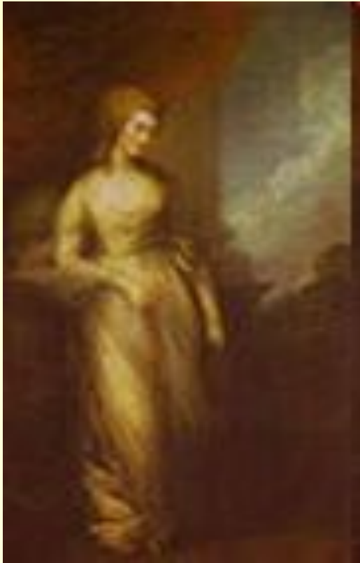
Her Grace Georgiana Cavendish, Duchess of Devonshire (1783)