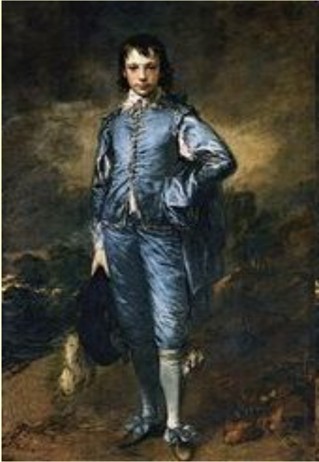
The Blue Boy (1770).