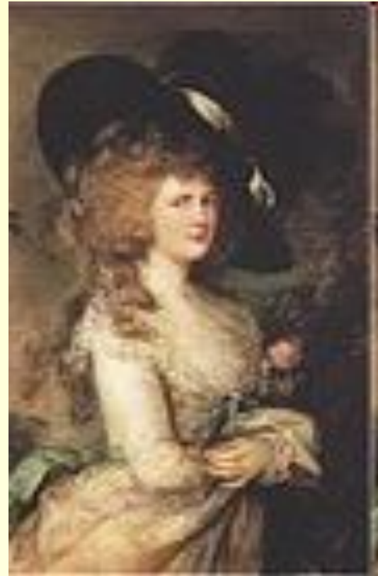
Her Grace Georgiana Cavendish (1787)