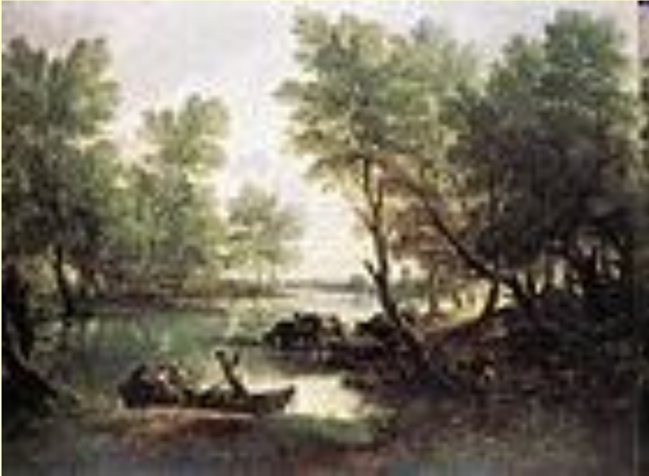
River Landscape (1768–1770)