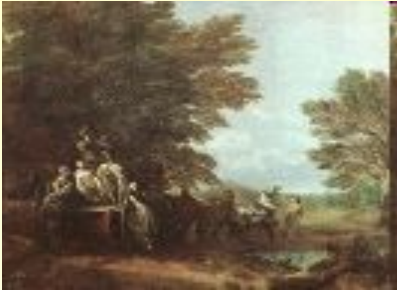
The Harvest Wagon (c. 1767)