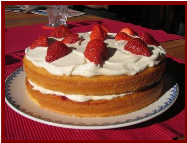
The Victoria Sponge Named after Queen Victoria

Although many foreigners find British food disgusting, British teenagers in the survey enjoy eating bacon sandwiches, baked beans, cheddar cheese and curry (well, it's not British but it is one of Britain's most popular foods). Also, we know it's a British stereotype but many British teenagers still like drinking a nice cup of tea in the morning.