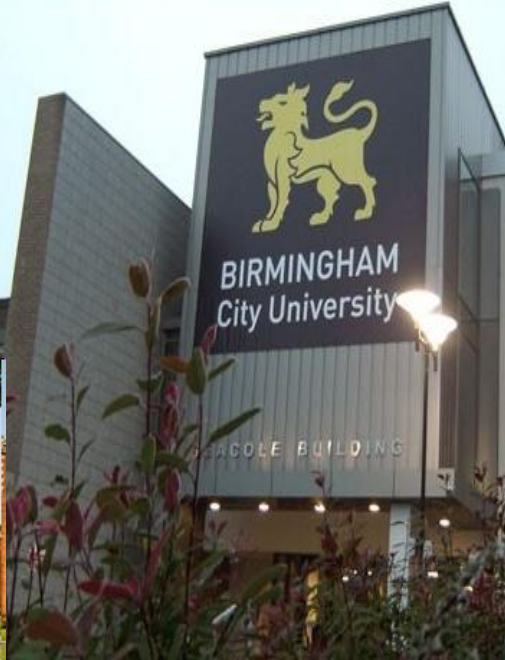
BIRMINGHAM City University