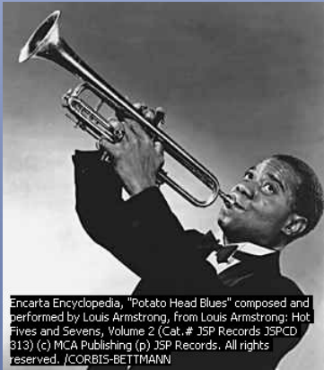
Encarta Encyclopedia, "Potato Head Blues" composed and performed by Louis Armstrong, from Louis Armstrong: Hot Fives and Sevens, Volume 2 (Cat. # JSP Records JSPCD 813) (c) MCA Publishing (p) JSP Records. All rights reserved.