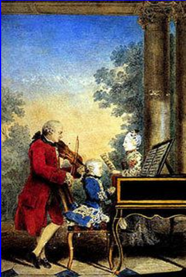
The Mozart family on tour: Leopold, Wolfgang, and Nannerl. Watercolor by Carmontelle, ca. 1763[8]