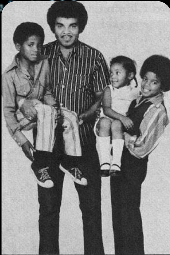
Joe Jackson, the J-5's father!