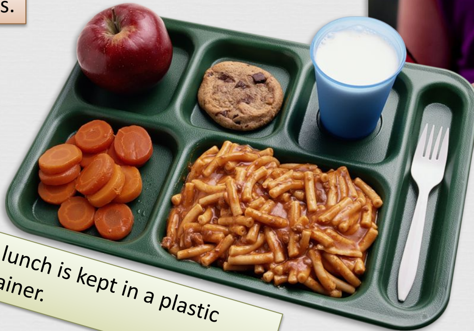
The lunch is kept in a plastic container.