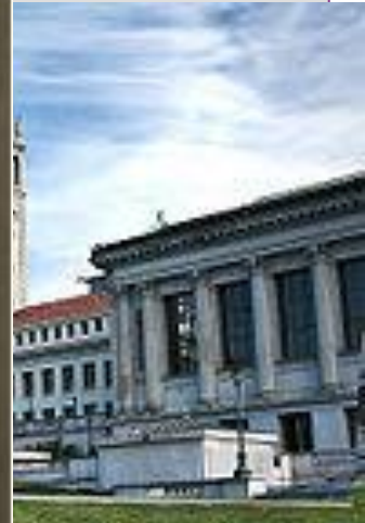
University of Berkeley, Oppenheimer 1929 to 1943