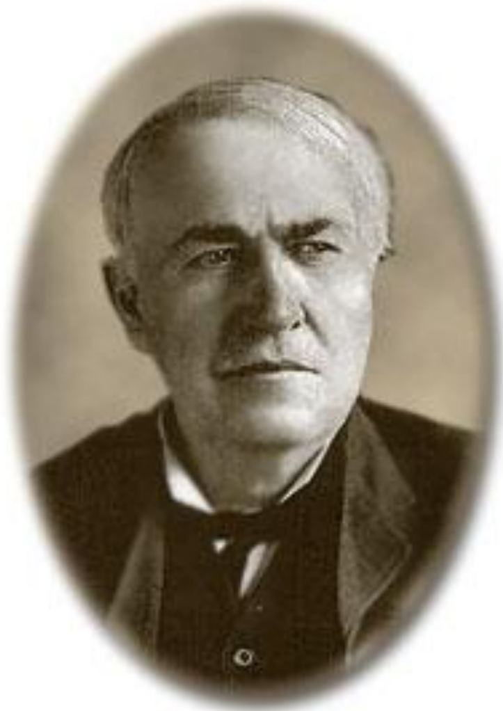
Thomas Alva Edison (1847-1931)