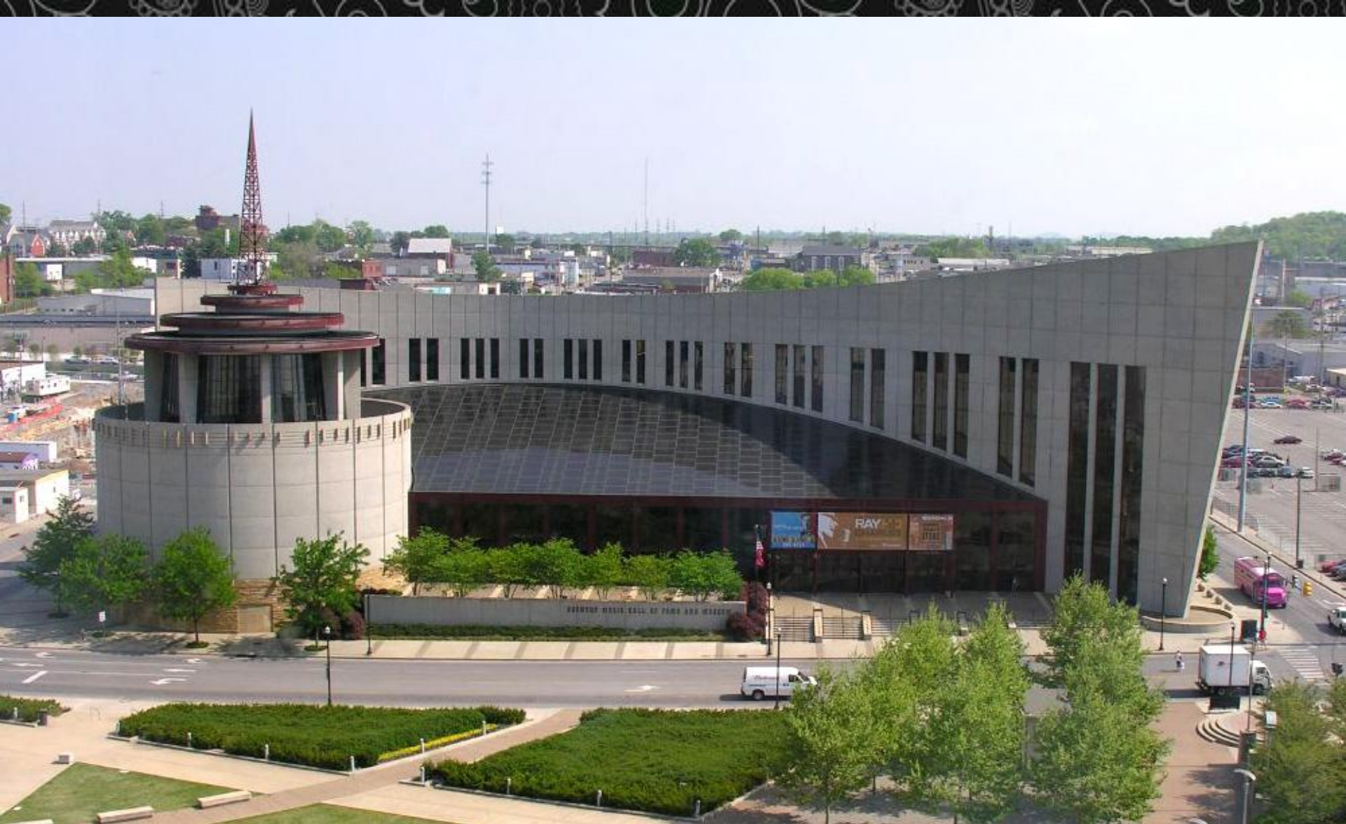
Country Music Hall of Fame and Museum