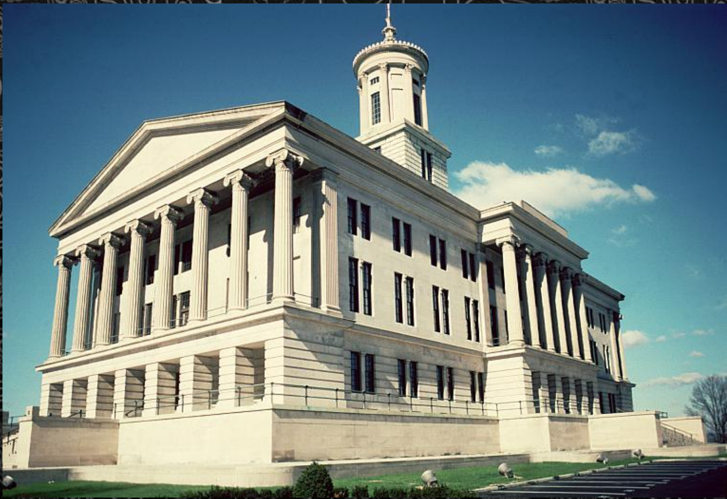
Tennessee State Capitol