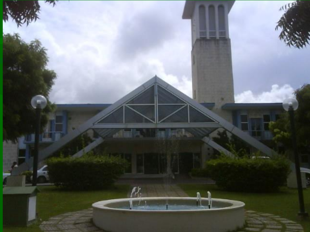
University of West Indies

In Jamaica in colonial days XVII-XIX centuries predominant characteristic of colonial cities rectangular layout with buildings in the spirit of English architecture: the Cathedral of St. Catherine in Spanish Town (1655 ) Fortress Rokfort in Kingston (end of the 17-19 century), former home military headquarters , now the Palace of government in Kingston (18th century) . Simple folk house - wooden storey three bedroom houses with porches . Wealthy suburban homes built in the spirit of the American " colonial style " . Since the mid XX century building apartment buildings in the style of constructivism ( University of West Indies , residential neighborhood in Kingston Nennivill ) .