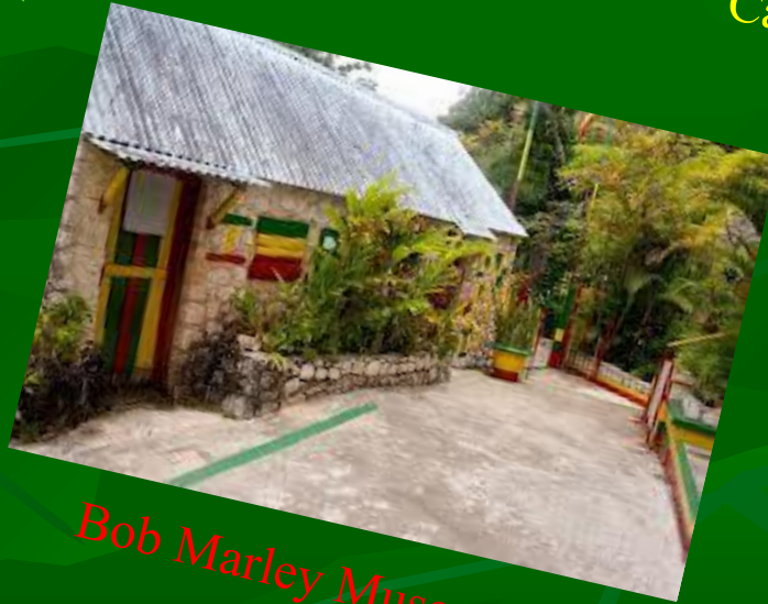
Bob Marley Museum