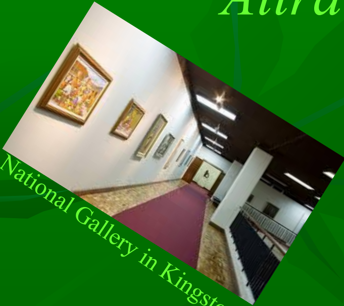
National Gallery in Kingston