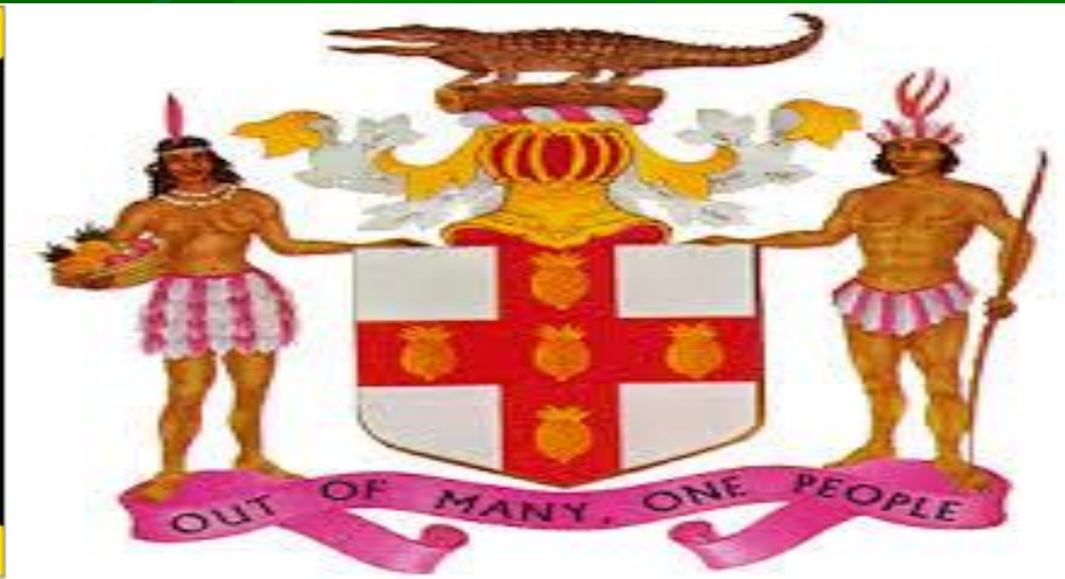
Coat of arms of Jamaica