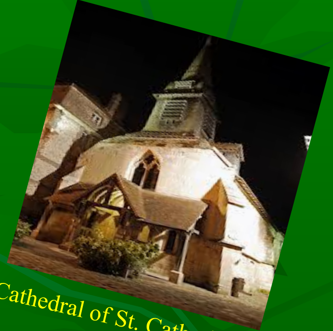
Cathedral of St. Catherine