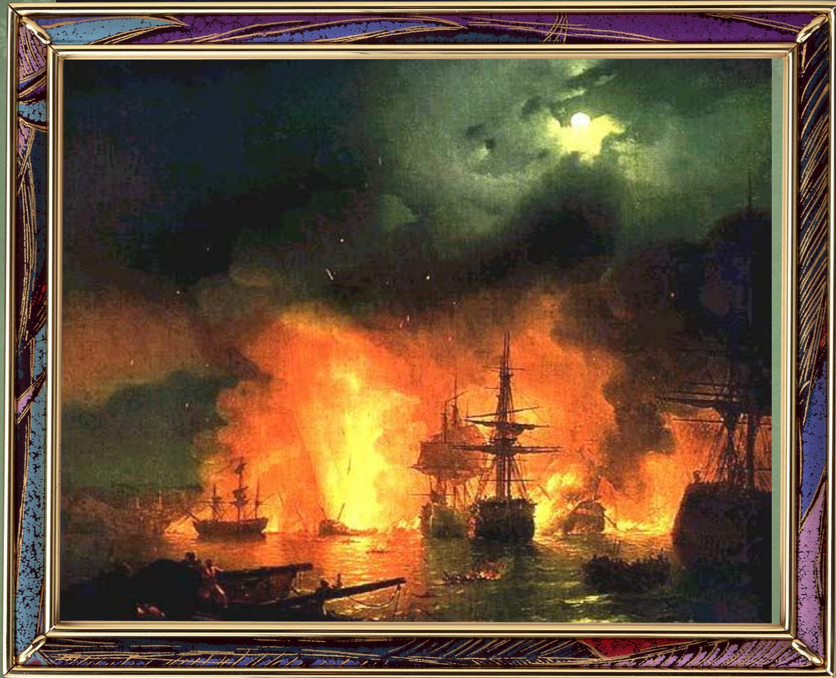
The Battle(Чесменский бой)