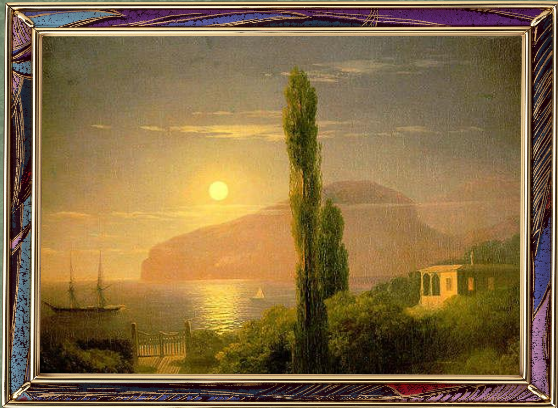
Moonlit night in the Crimea (Лунная ночь в Крыму)