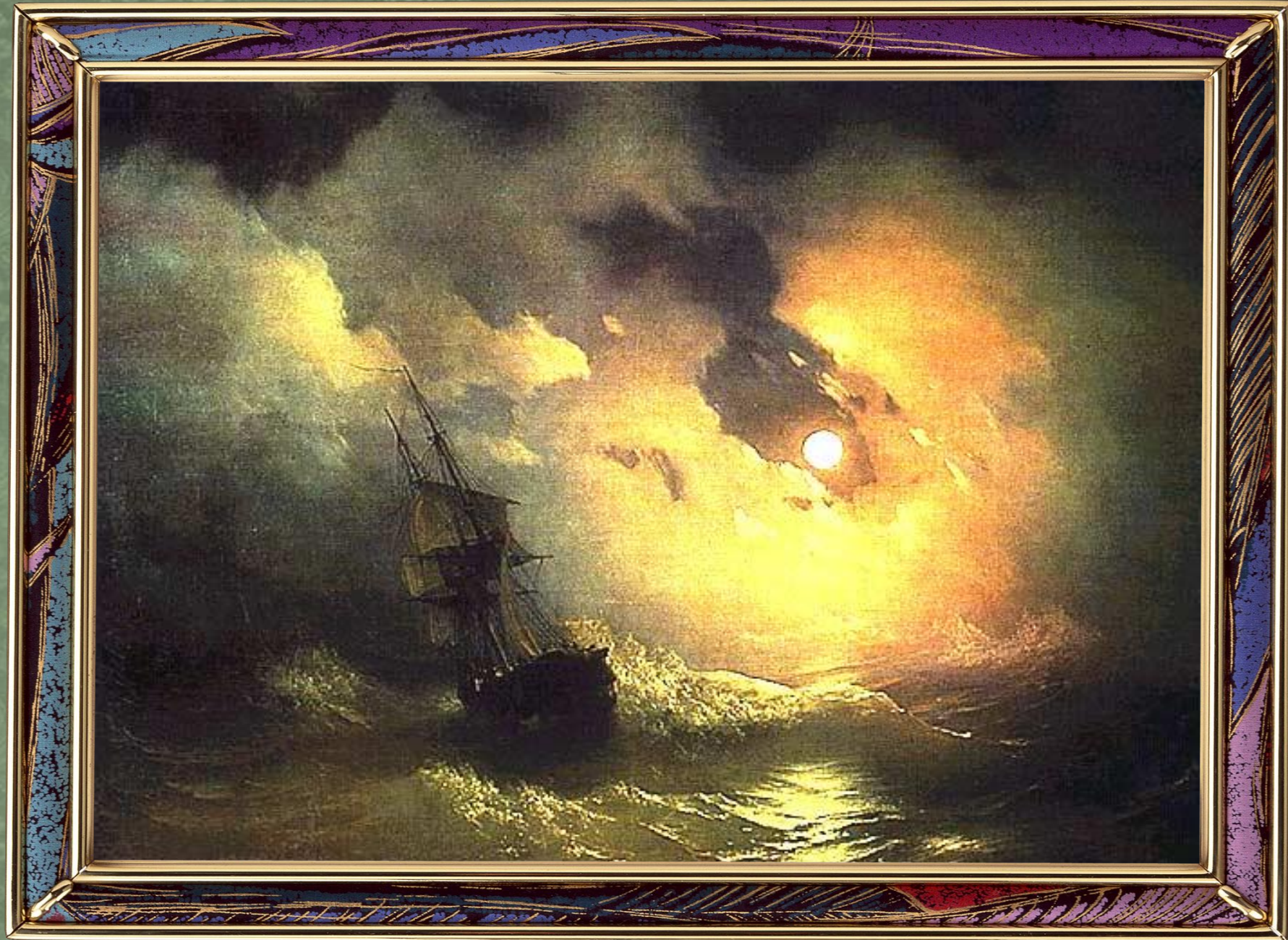
Storm in the Night(Шторм в ночи)