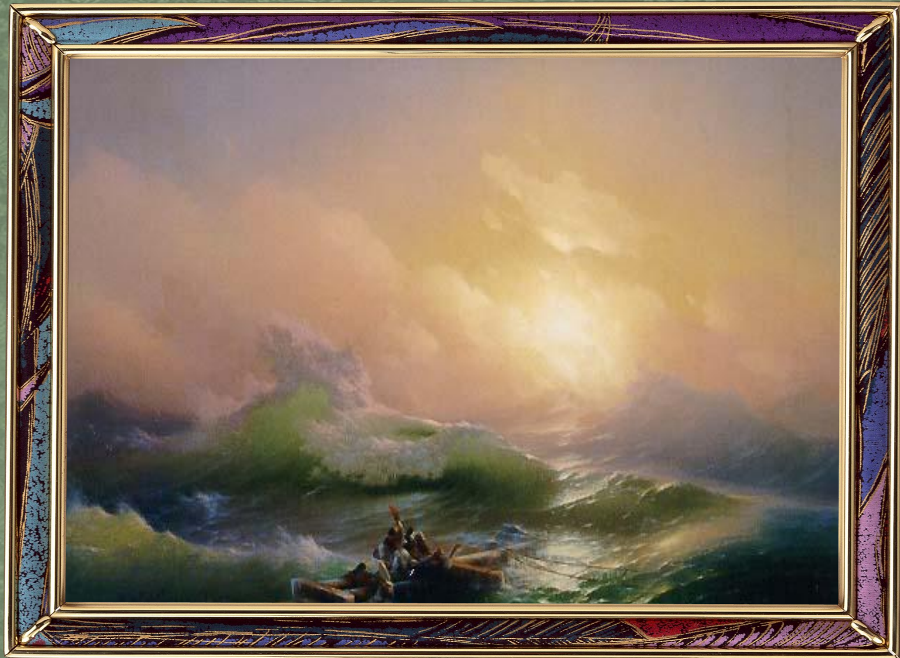
Tenth wave (Девятый вал)