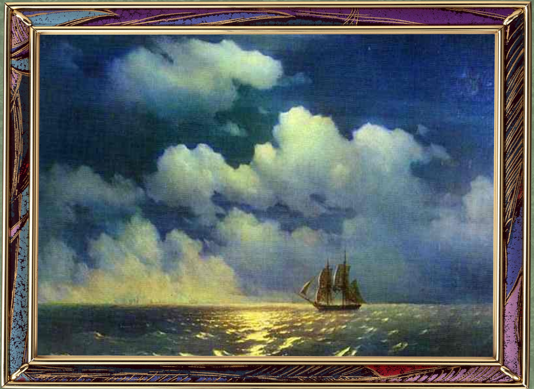
Meeting Brig Mercury with the Russian squadron