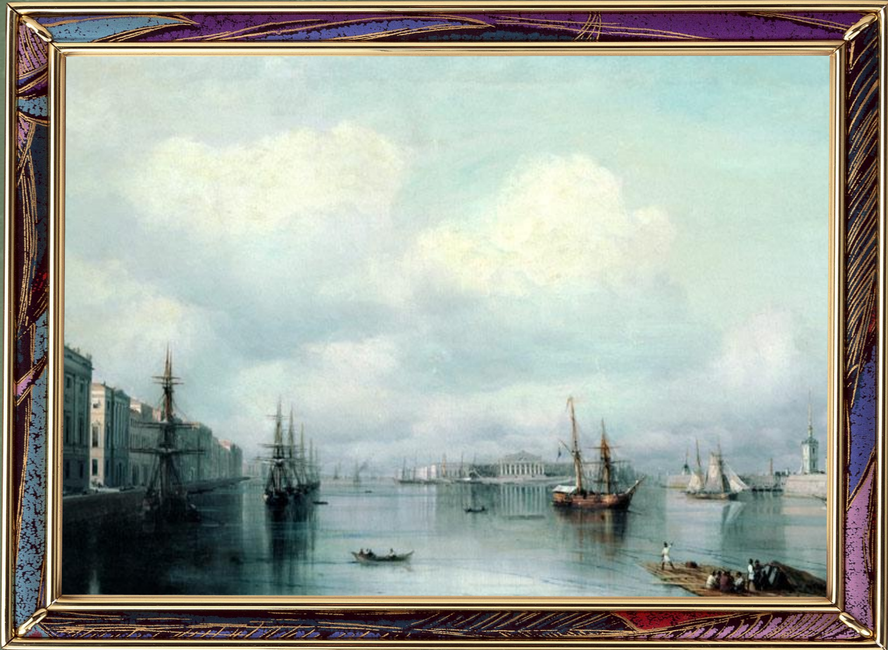
View of St. Petersburg (Вид Петербурга)