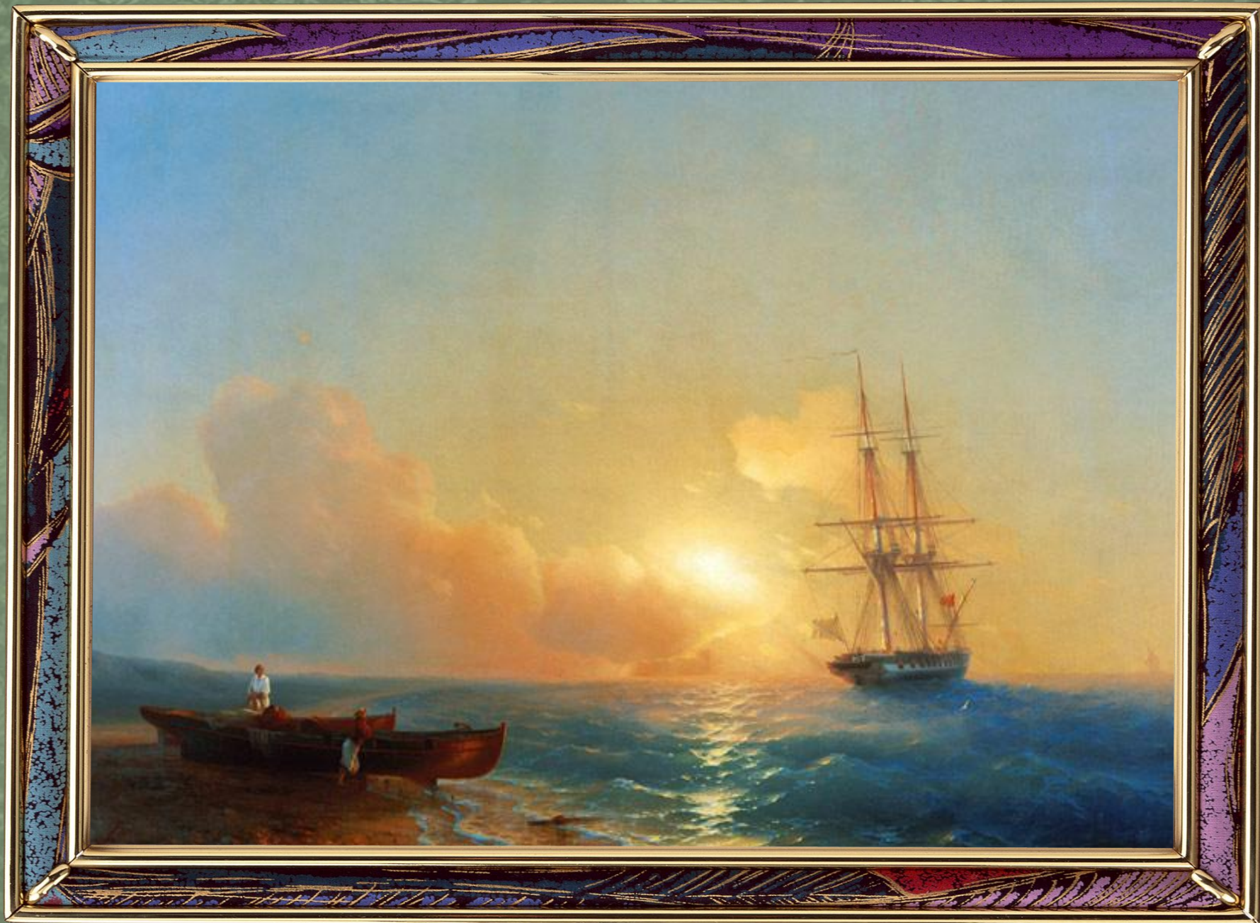
Fishermen on the beach(Рыбаки на берегу моря)