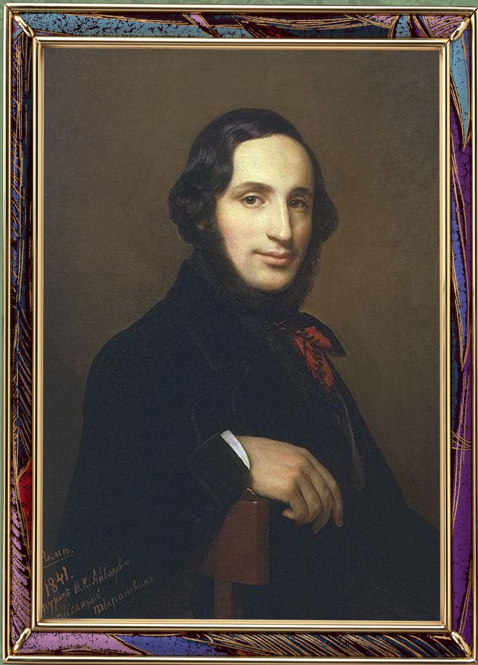
Portrait I. Ayvazovsky (1841)