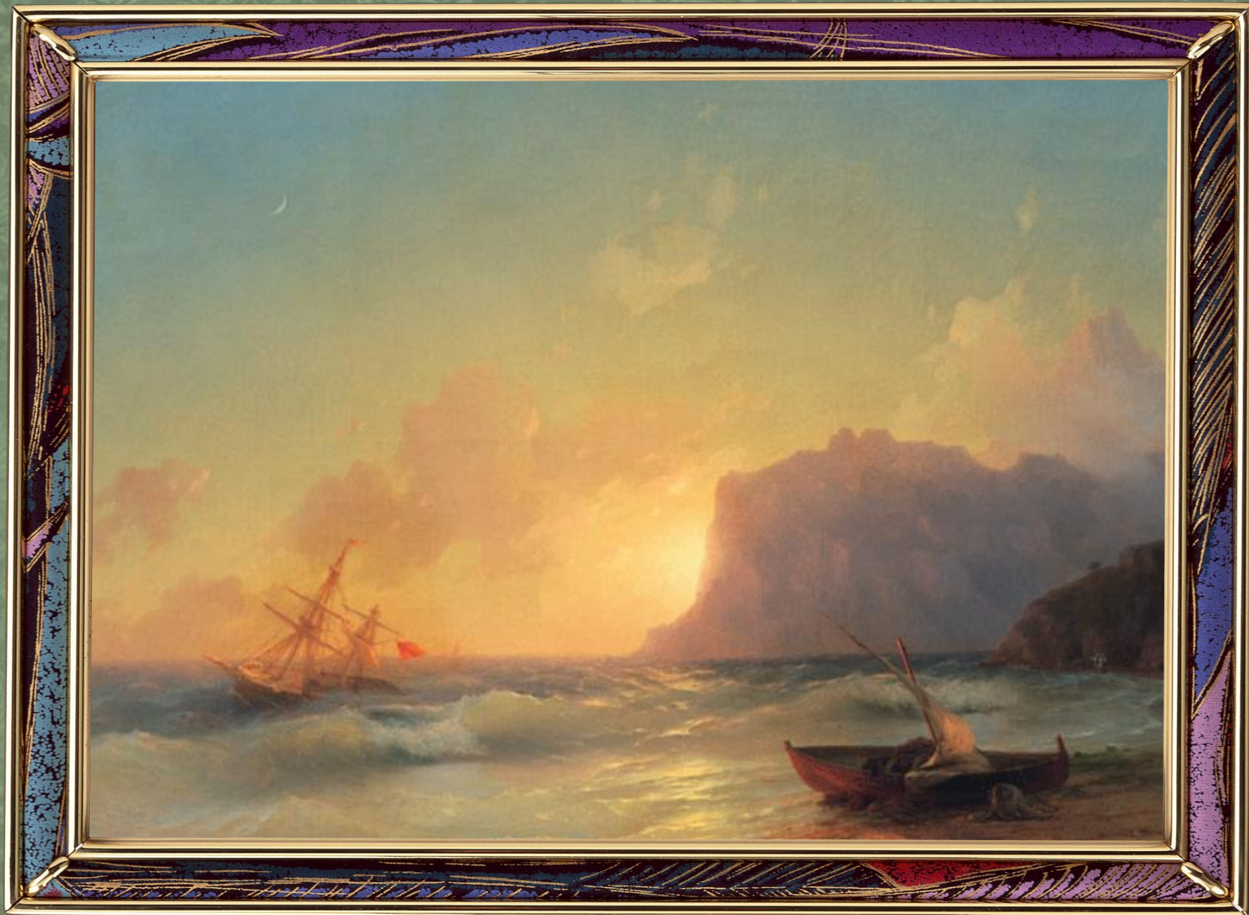
Sea. Koktebel (Море. Коктебель)