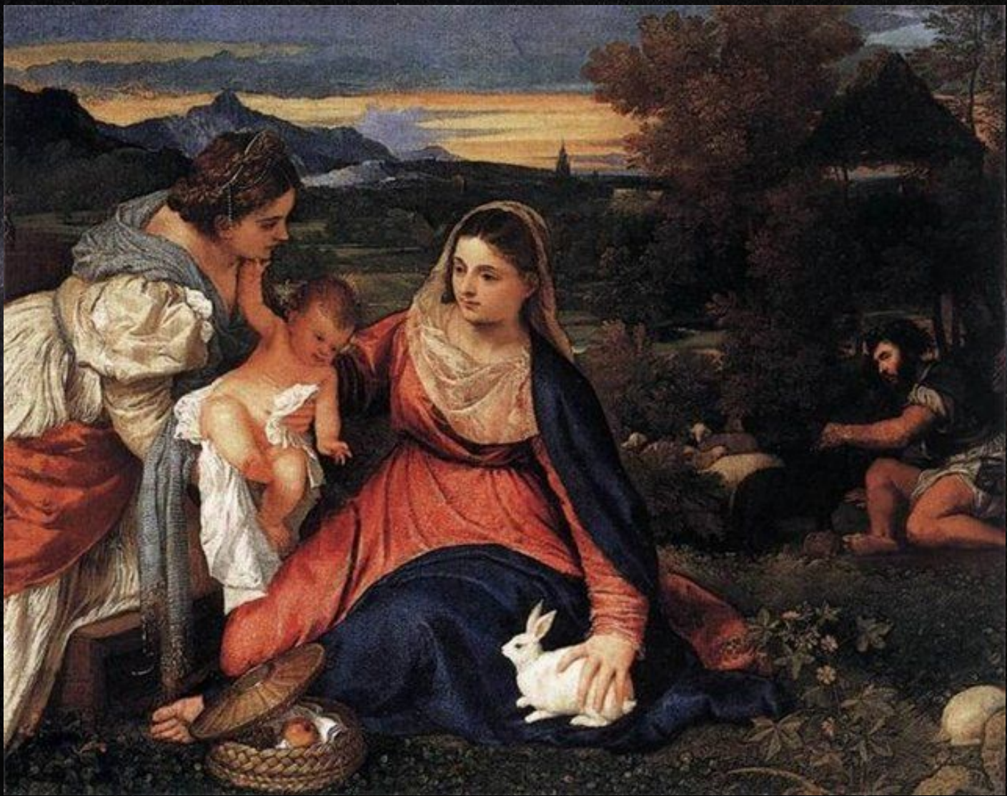
"Madonna with Child and Catherine of Alexandria"