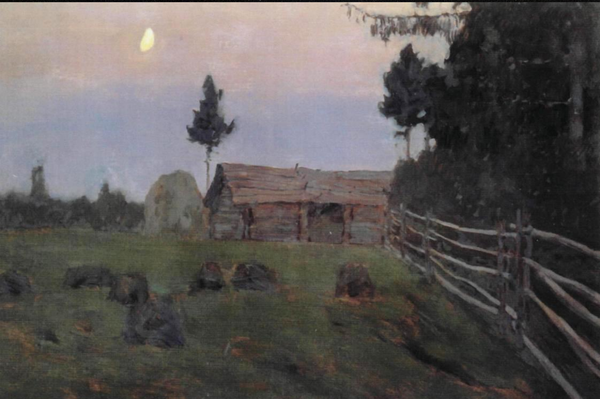
«Twilight» Isaac Levitan