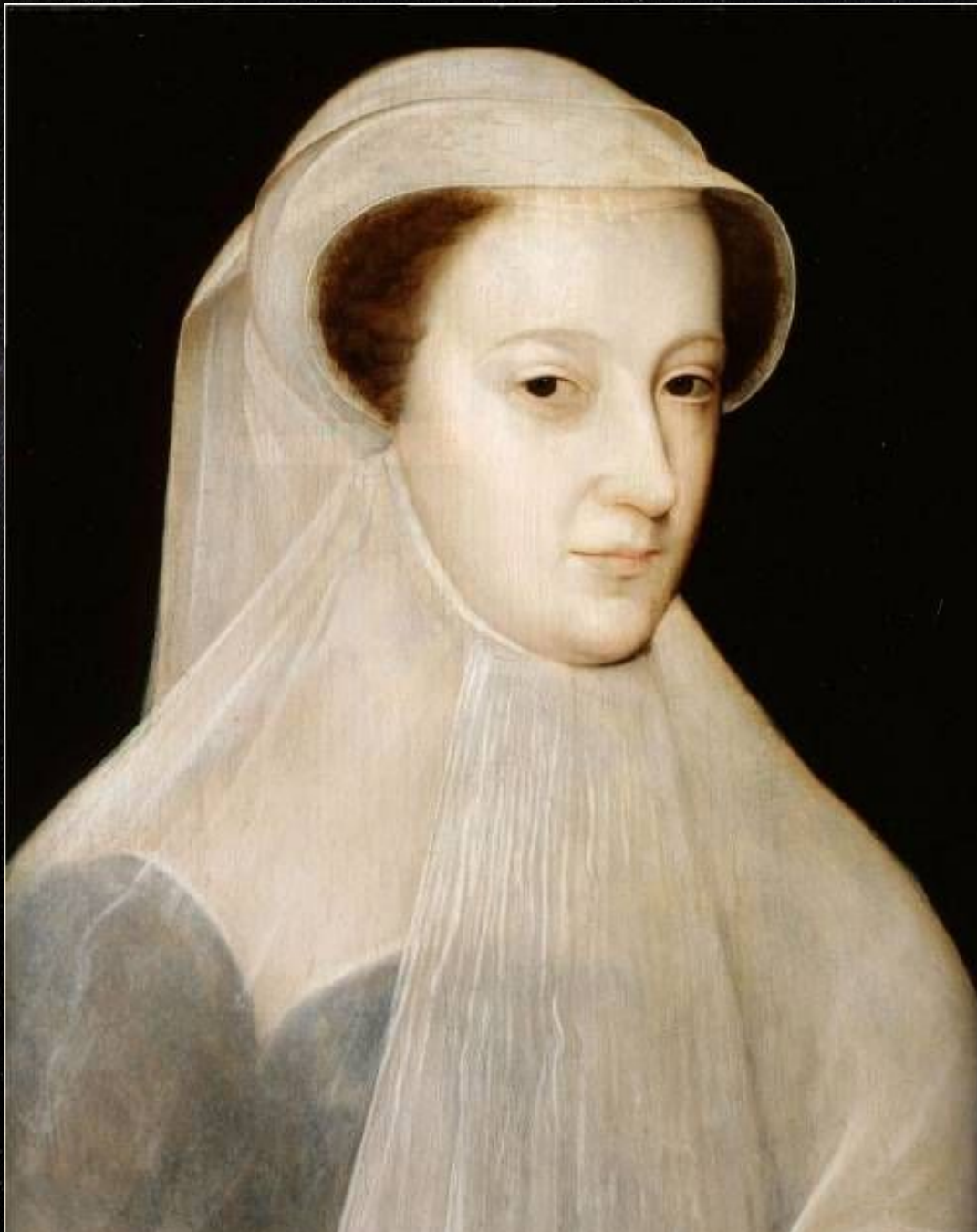
Portrait of Mary Stuart