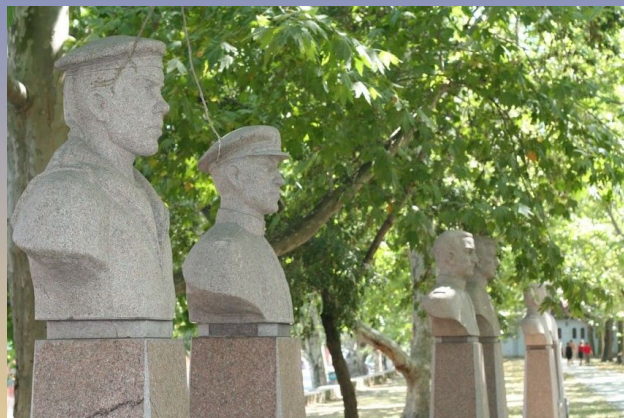
■ Avenue of heroes