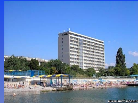
Park Sanatorium of Ministry of Defence