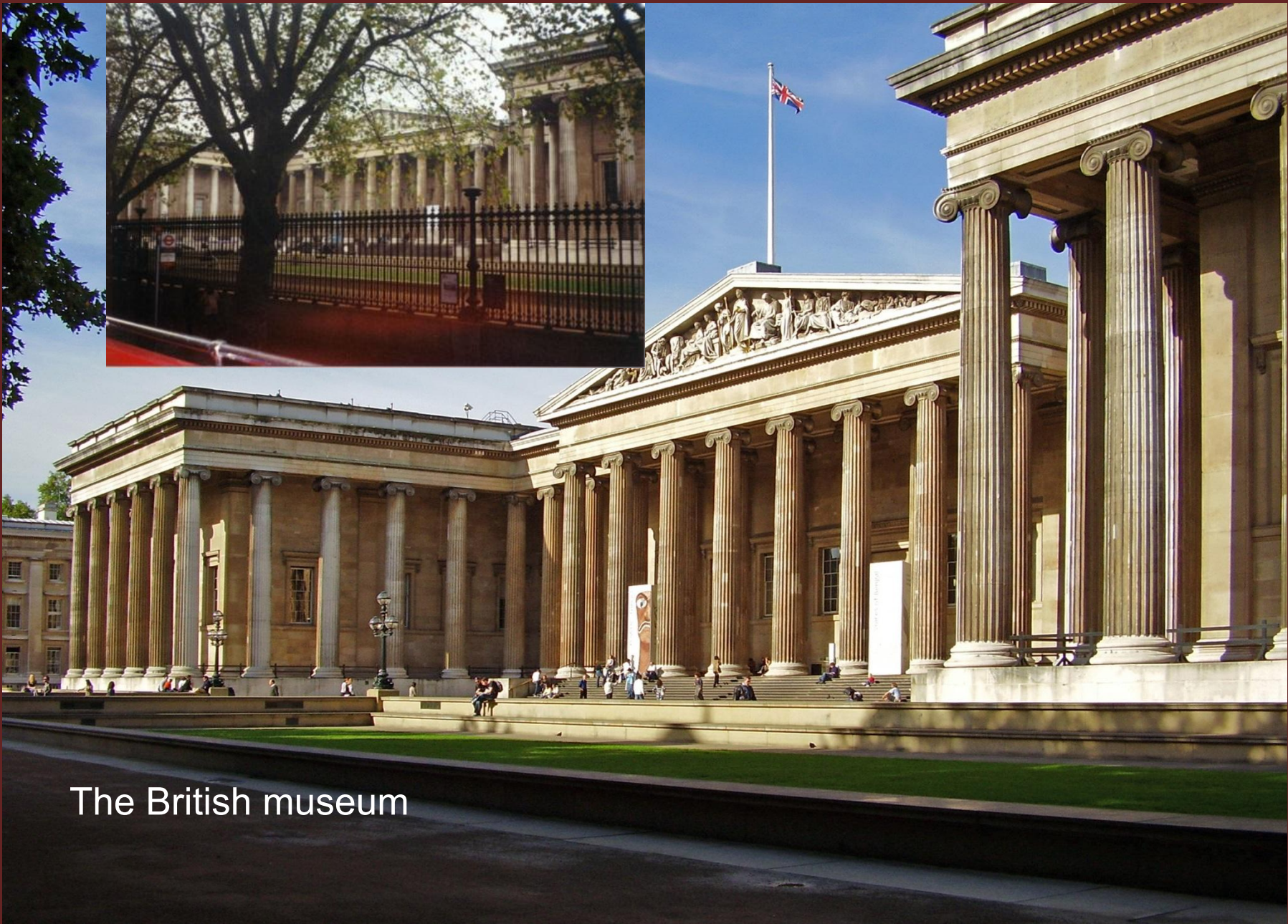
The British museum