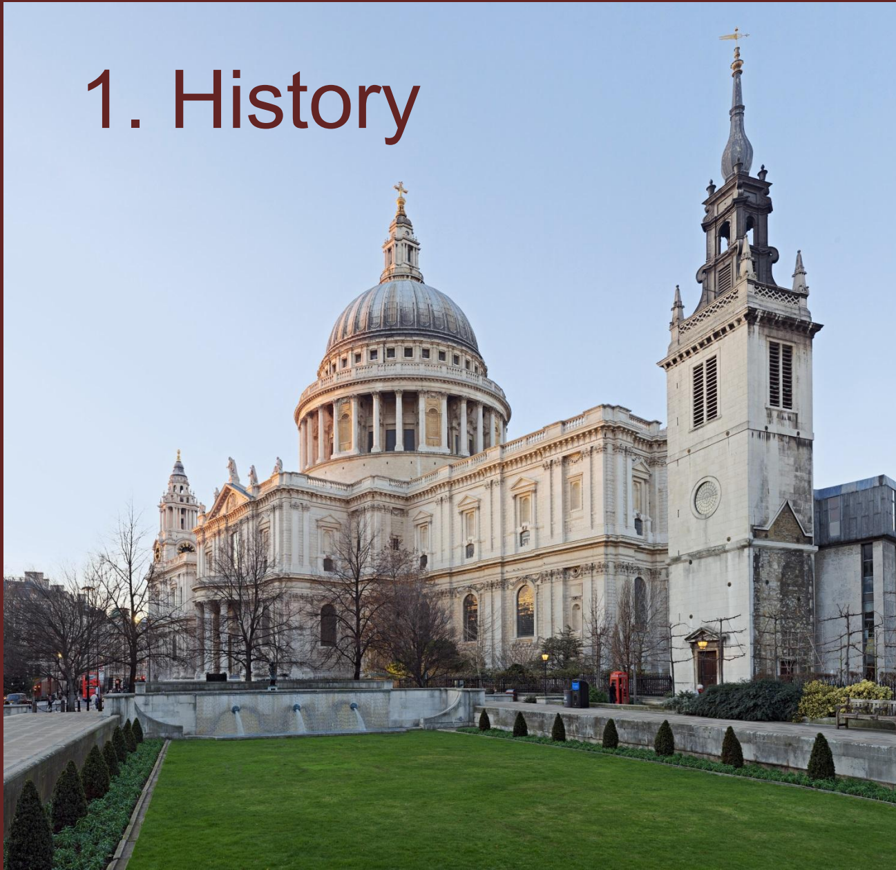
St Paul's cathedral