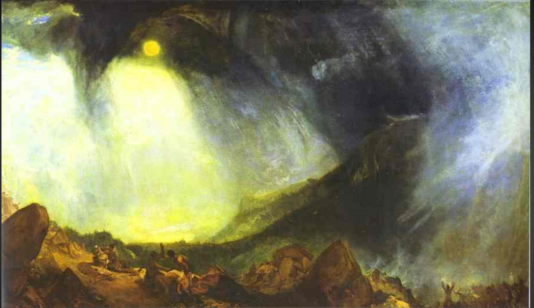
Snow Storm: Hannibal and His Army Crossing the Alps. 1812. Oil on canvas. Tate Gallery, London, UK.