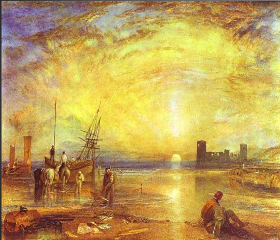
Flint Castle. 1838. Watercolour on paper. Private collection, Japan.