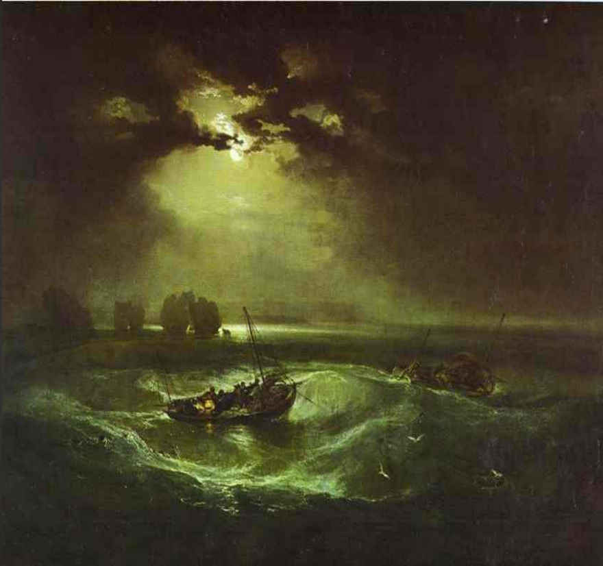
Fishermen at Sea. 1796. Oil on canvas. Tate Gallery, London, UK.