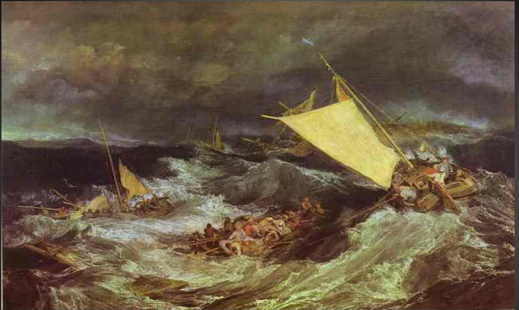
The Shipwreck. 1805. Oil on canvas. Tate Gallery, London, UK.