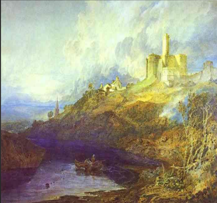
Warkworth Castle, Northumberland - Thunder Storm Approaching at Sun-Set. 1799. Victoria and Albert Museum, London, UK.