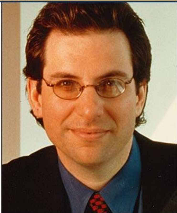
* Kevin Mitnick