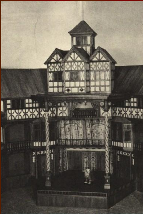
Entrance of The Globe Theater