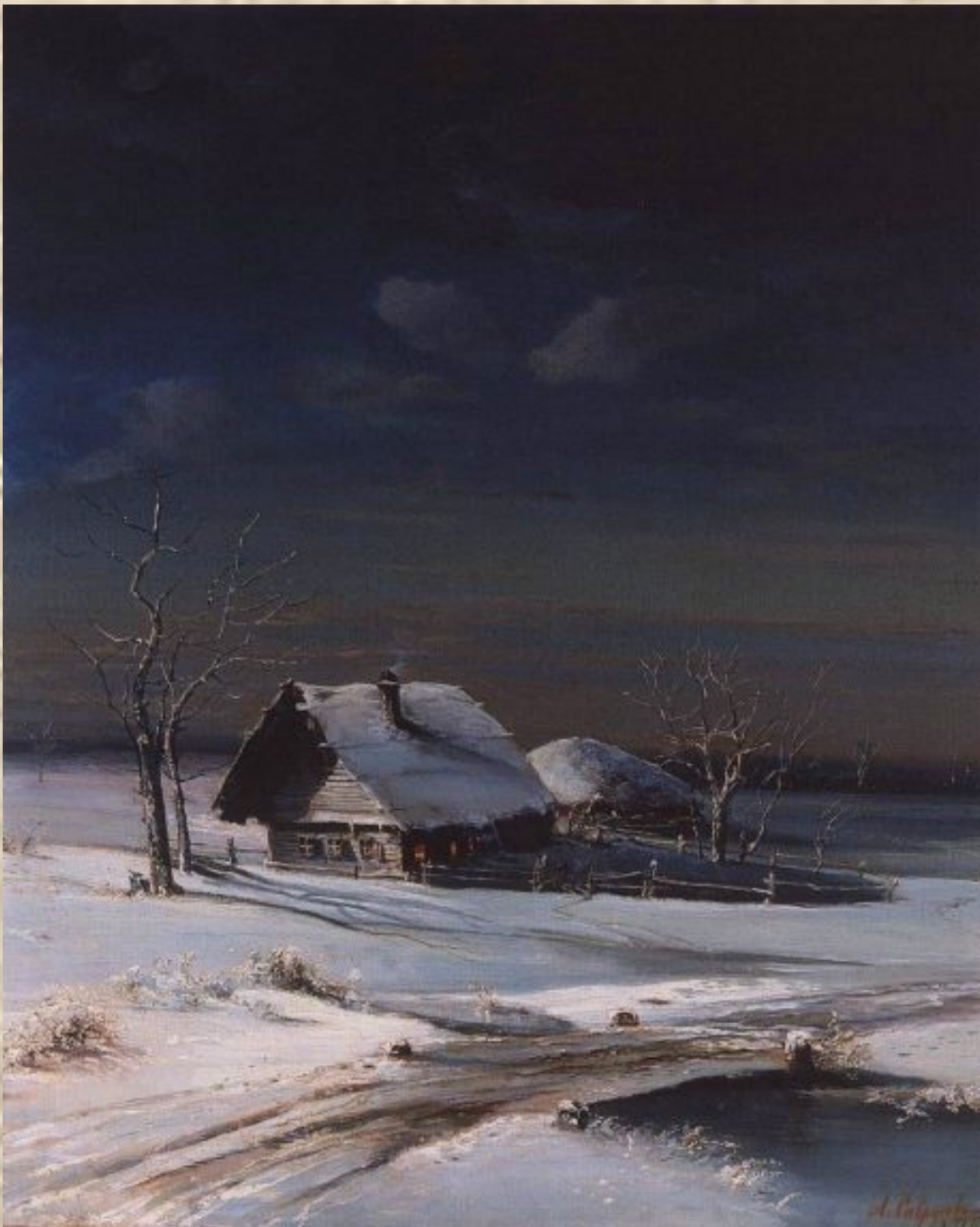
Winter landscape. (1871)