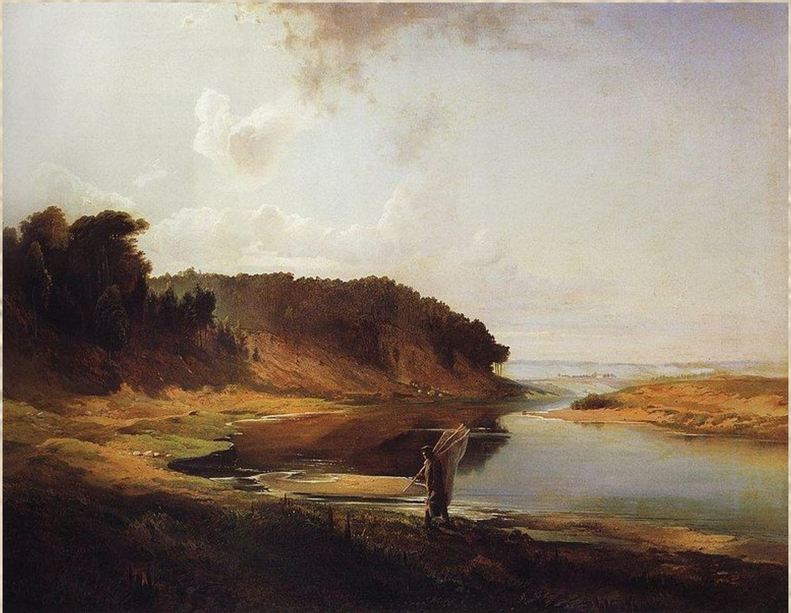
Landscape with River and Angler (1859).