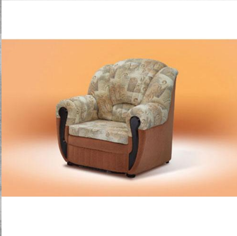
It's a table