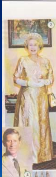
The Queen- Elizabeth II