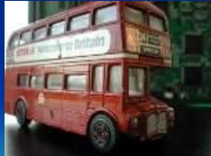
The double-decker bus