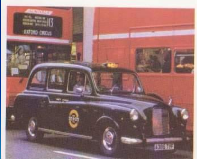
London taxis are called black cubs.