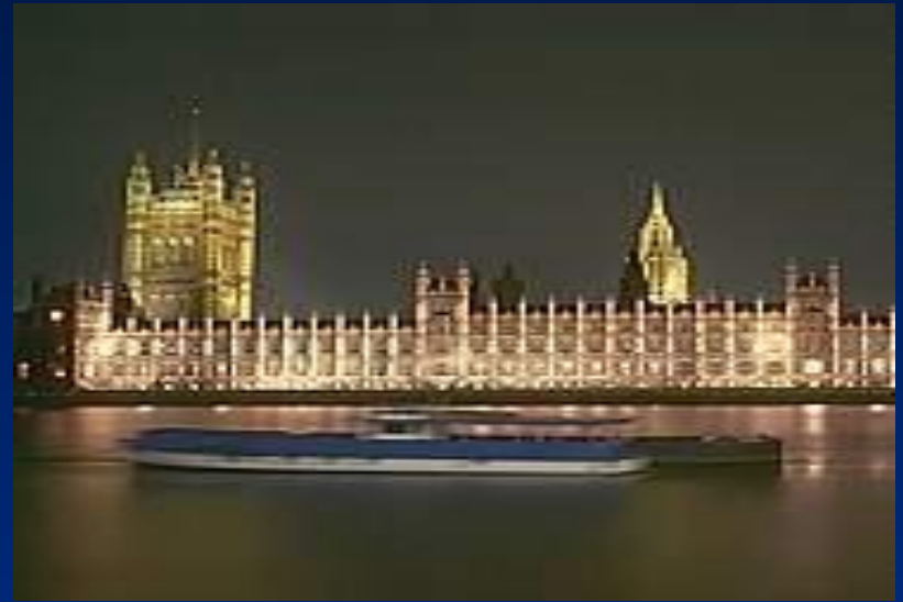
Houses of Parliament