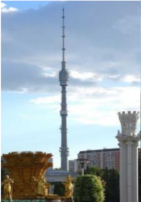
The Ostankino Tower