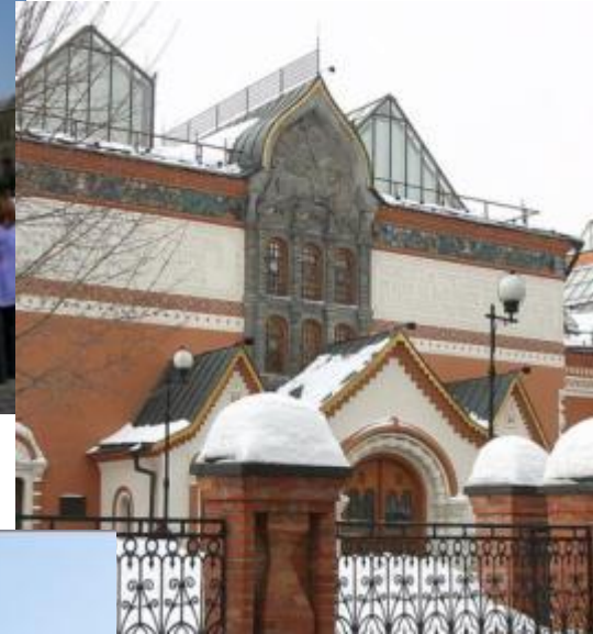
The Tretyakov Gallery