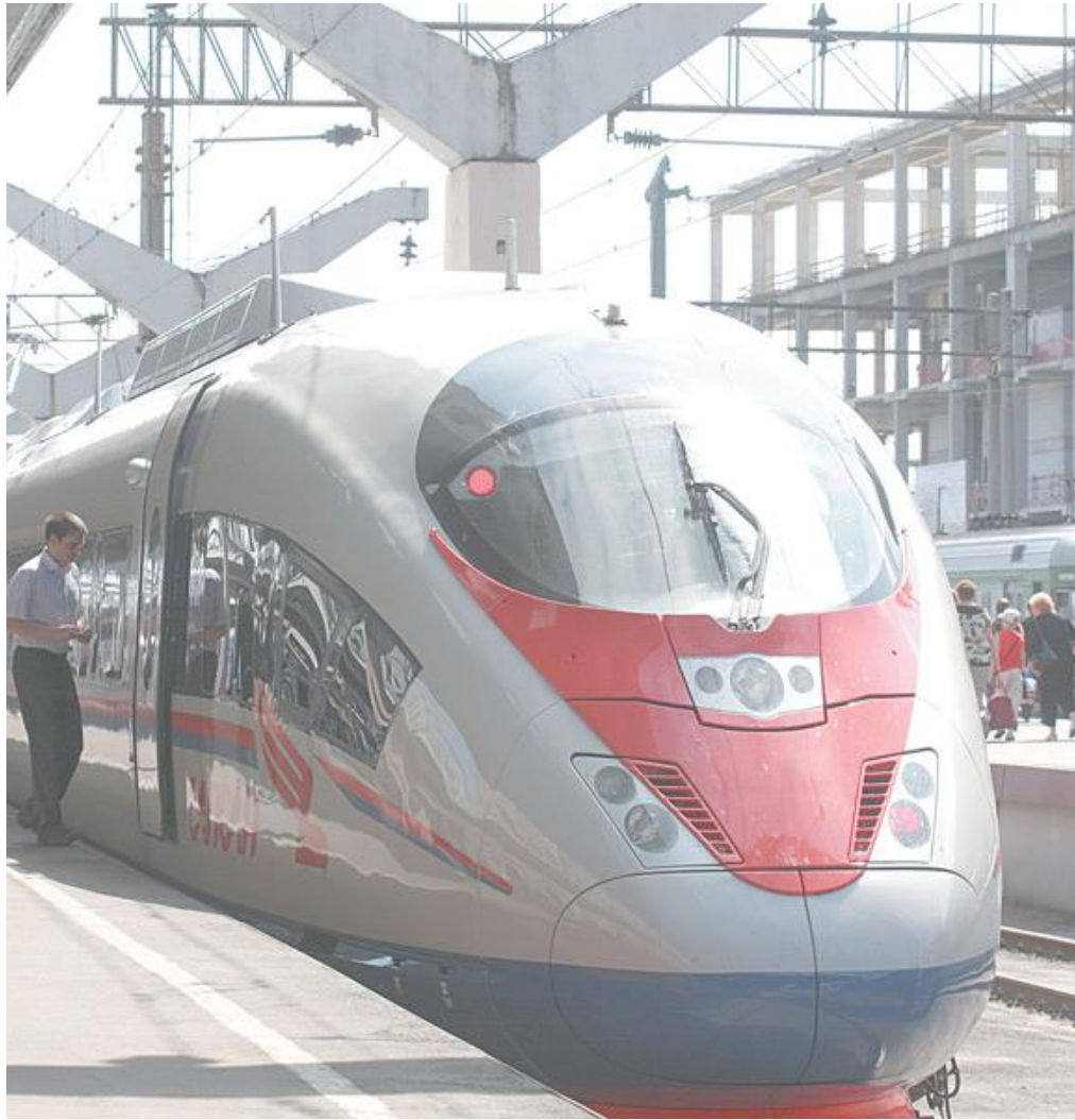
Russia's first high-speed train, the Sapsan