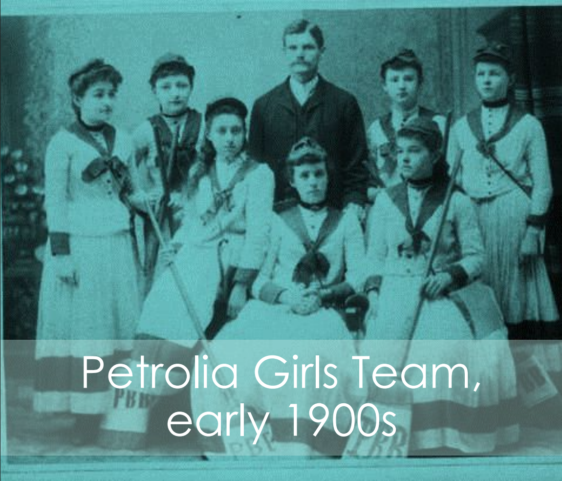
Petrolia Girls Team, early 1900s