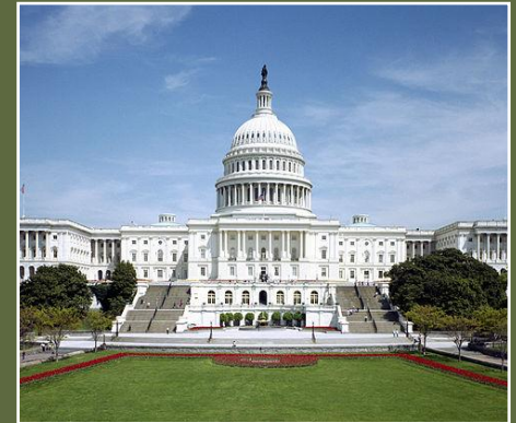
The US Capitol

is the seat of the United States Congress, located atop Capitol Hill at the eastern end of the National Mall in Washington, D.C.