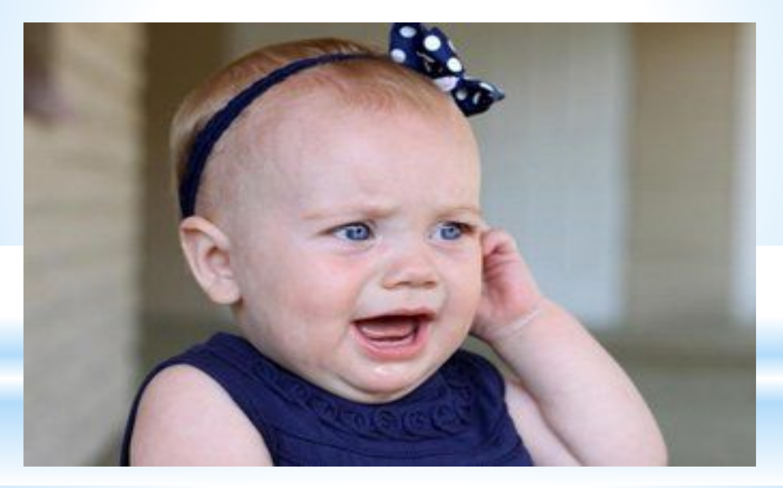
She has an earache