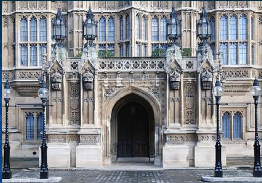
Ornate entrance, Palace of Westminster.

Statue of Richard I of England I (8 September 1157 - 6 April 1199), also known as Richard the Lionheart, or Cœur de Leon.