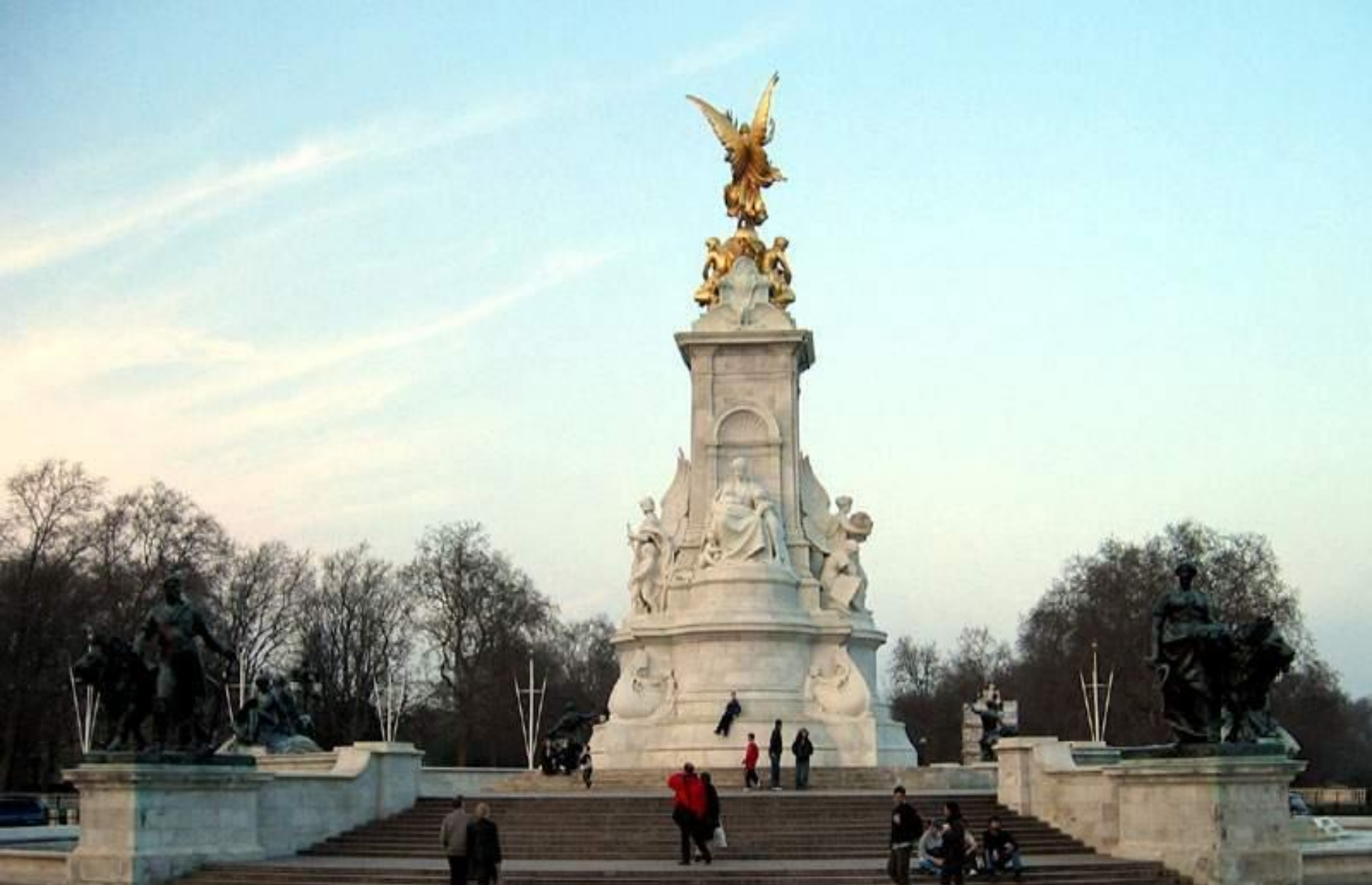
Queen Victoria's Memorial