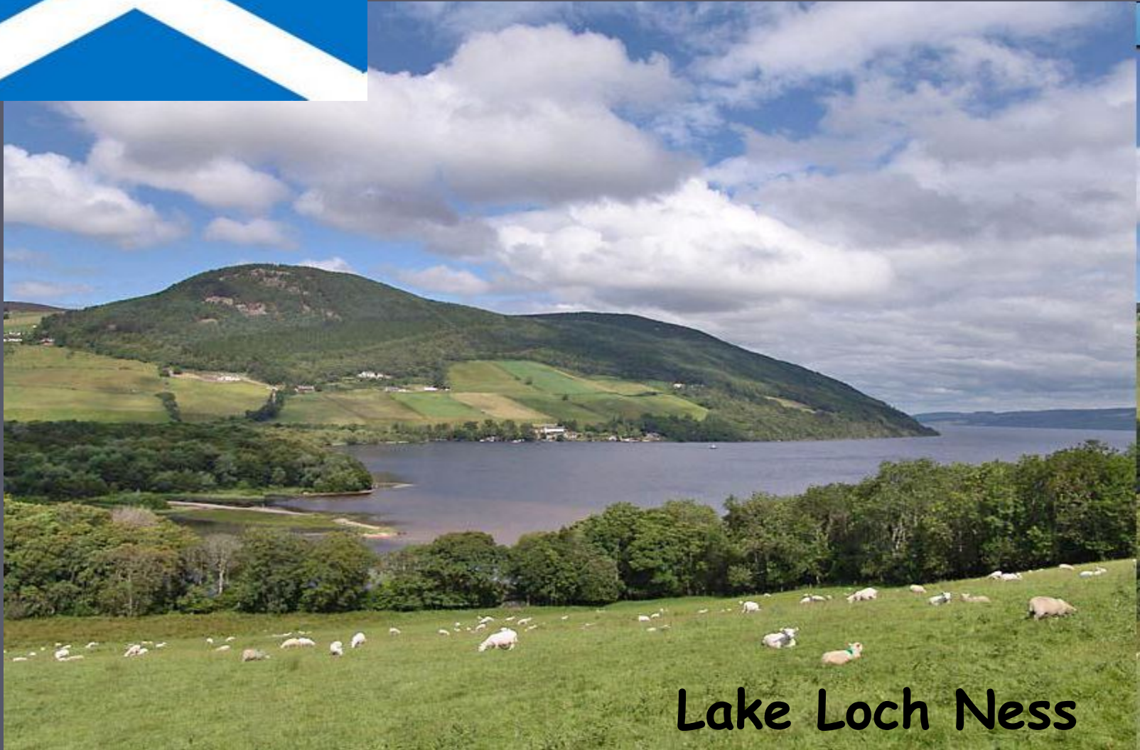
Lake Loch Ness

The cross of St. Andrew is the patron saint of Scotland.